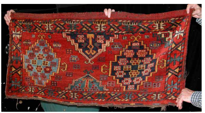
[2] A truly splendid piece, with the Chodor Ertmen gul design