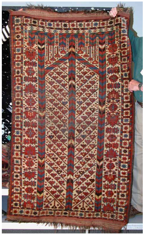
[13] "Beshir" prayer rug with unusual design, lacking the ram's-horns at apex of niche. Perhaps Bukhara