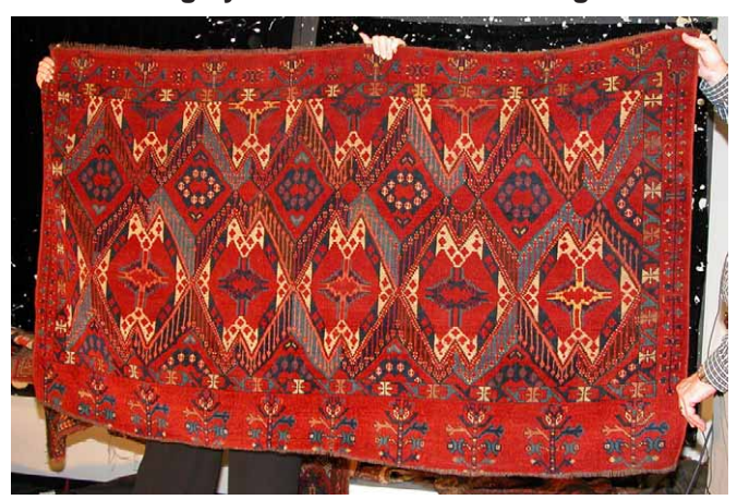
[5] Magnificent chuval with lattice of ak-gaimak guls; similar to piece in Textile Museum. An additional one was brought by an NERS member!