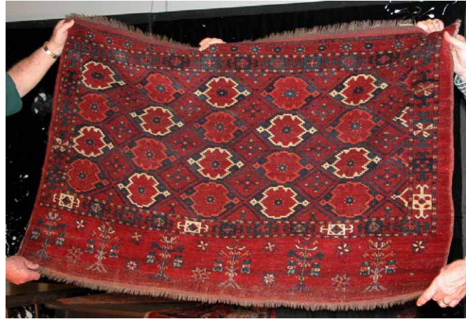
[11] Chuval with diagonal grid