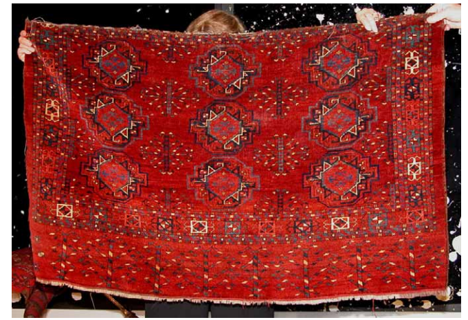
[1] A 3x3 gul chuval, with elaborate chemche secondaries. A piece with similar chemches materialized from the audience