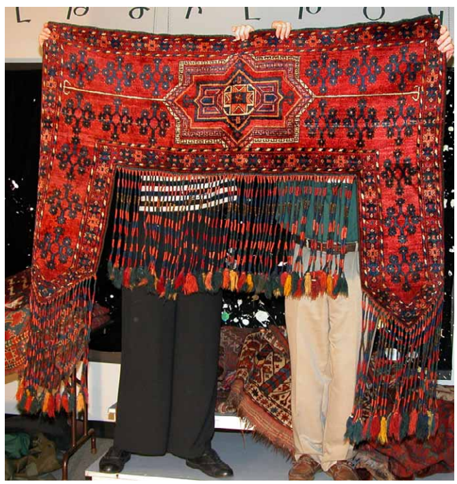
[4] A unique kapunuk (door surround). The cross piece at the top is adorned with a medallion similar to the one of [3]