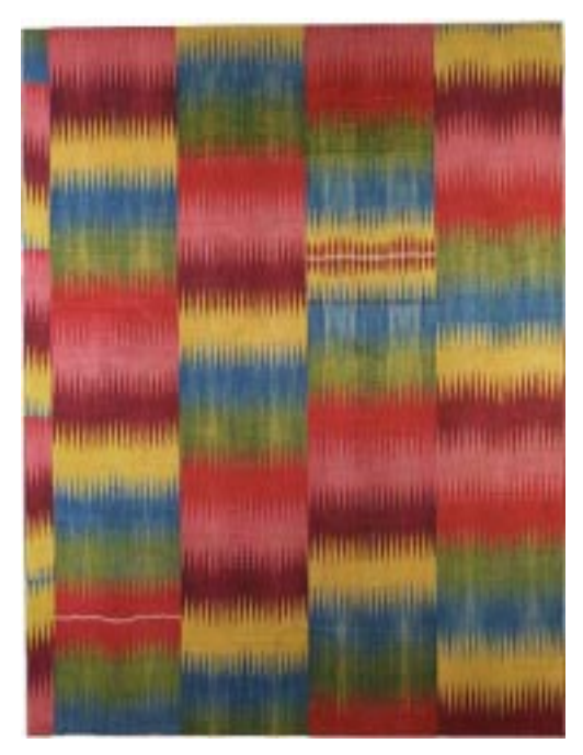
MFA's ikat panel, ca. 1850. 7'3"x5'6.5"

the rug world as a consultant. We wish her good luck in her endeavors.