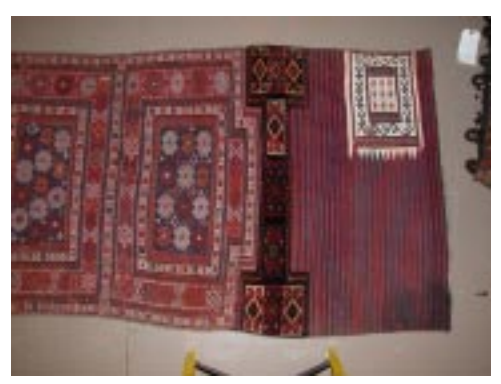
Sections of exhibit 32a (see page 11)