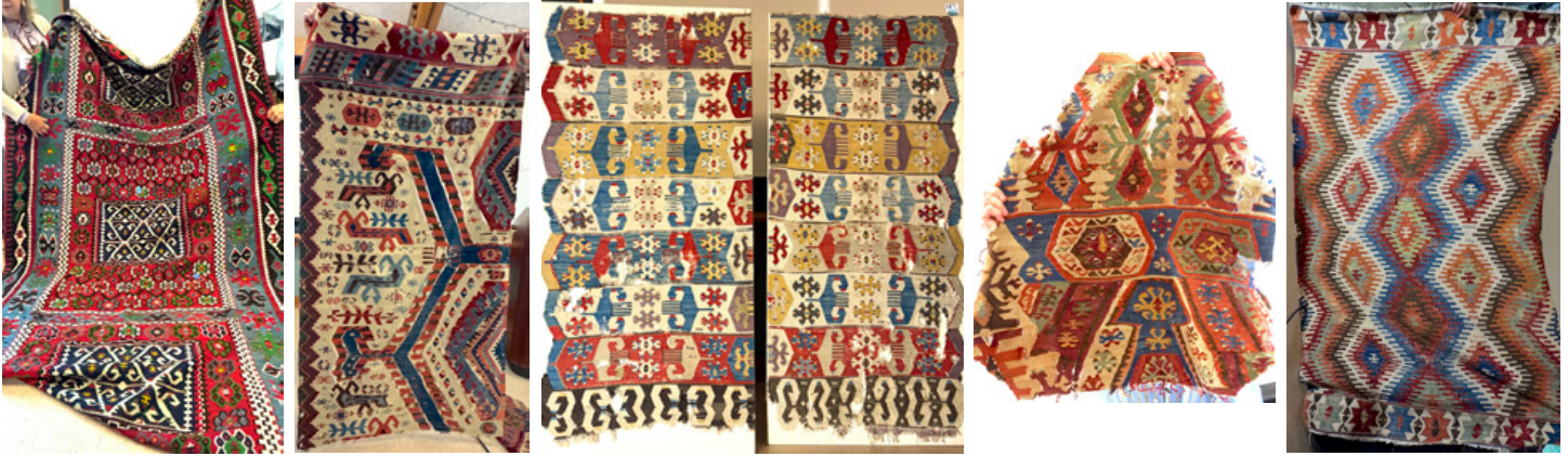
Anatolian kilims or fragments, from (left to right) Kayseri, Aydın, Cappadocia(?), unlocalized, Konya

participatory meeting featuring patterned-on-the-loom weavings from four continents. Of the profusion of examples displayed and discussed at the meeting, a representative selection is pictured here.