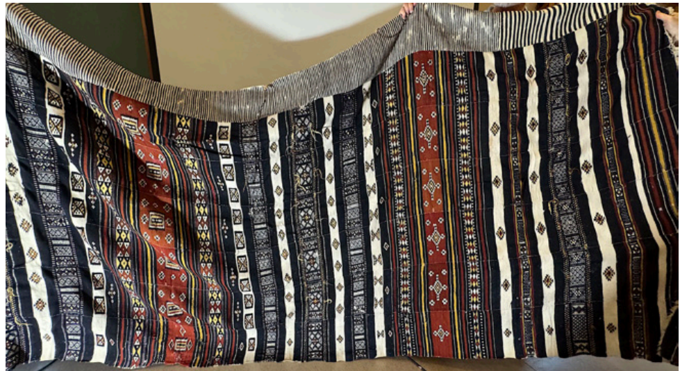
From left: Zagar Mengal grain bag, Baluchistan; Fulani decorative tent wall ( arkilla kerka ), Niger Bend, Mali