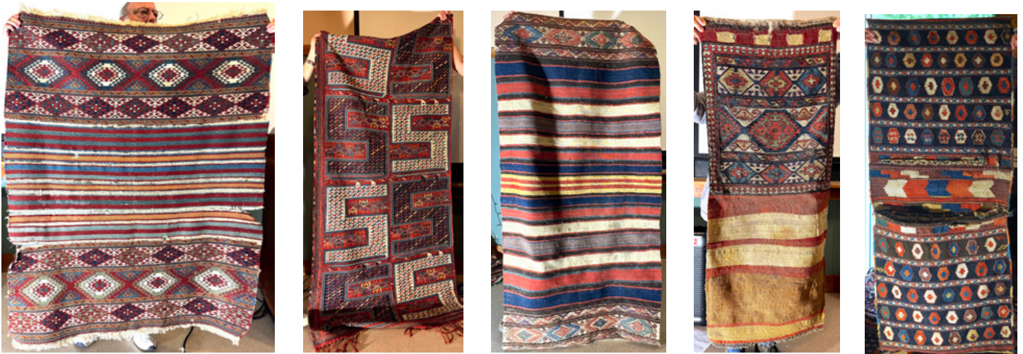
From left: Karabagh mafrash, Karabagh "dragon" sileh, Georgia/Armenia grain bag, Shahsevan single and double bags