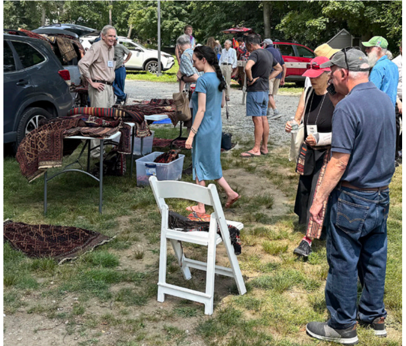
Picnickers, View editor included (above), can't resist the lure of rug shopping