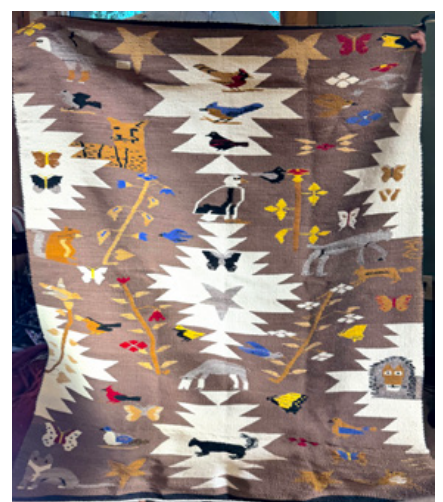
Left: carriage-cushion covers depicting the Flight into Egypt (above) and stylized garden imagery (below), both Skåne, Sweden Above: American overshoot coverlet, Navajo rug with birds and beasts