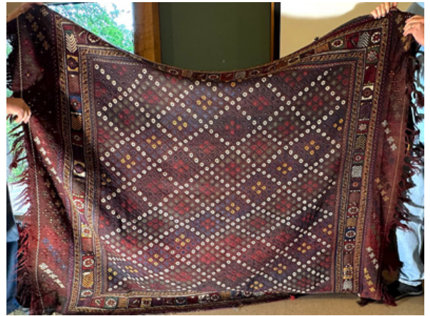
From left: Afshar sofreh, Luri Bakhtiari salt bag, Luri Bakhtiari verneh