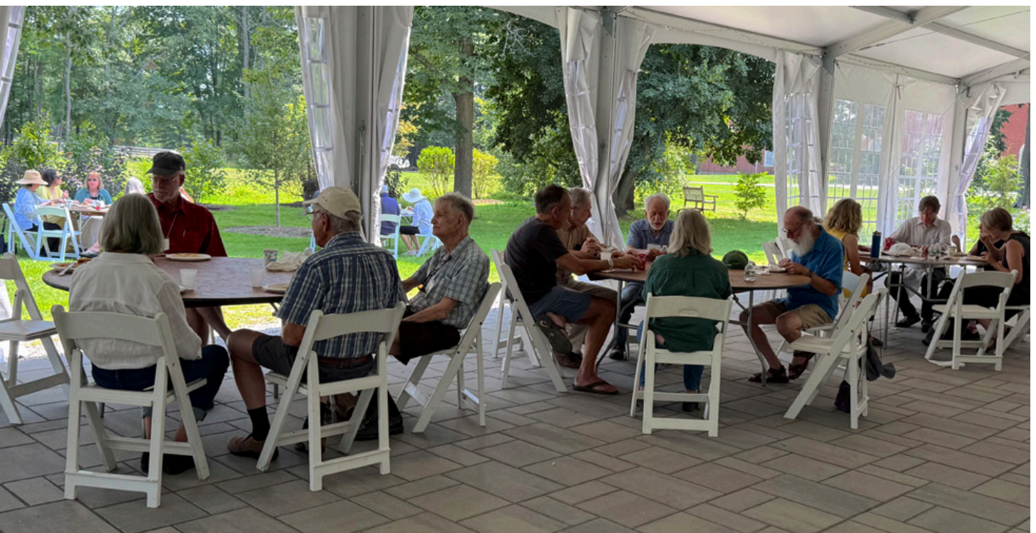
Attendees convene for lunch in the shade of tent or trees