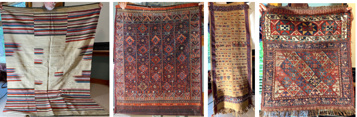
From left: Mazandaran kilim, Khorasan Kordi grain bag, Khorasan Kordi(?) sofreh, Lur of Fars bagface