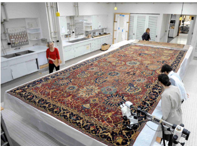
6. Examining a cut-down but still huge Persian "vase" carpet in the Met's Department of Textile Conservation