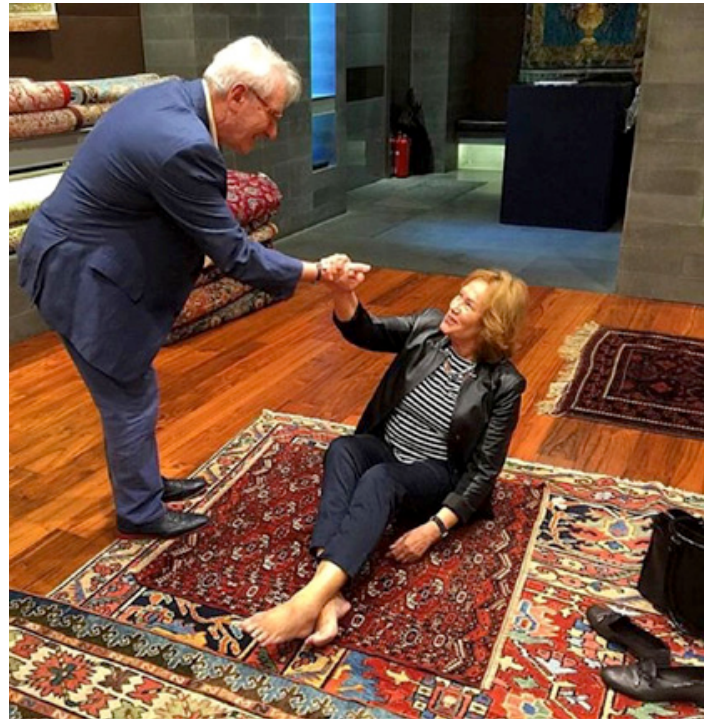
2. A couple renews their wedding vows on a Tekke dowry rug