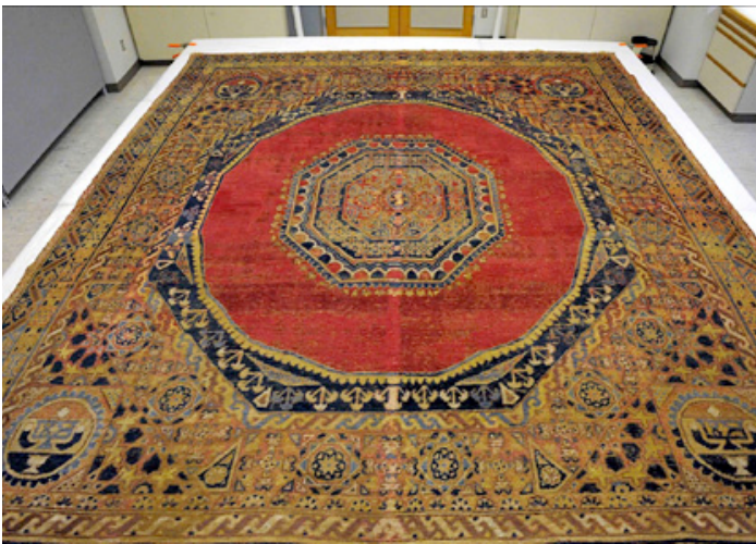
9 (top). The too-big-to-show Blumenthal medallion carpet 10 (bottom). The reknotted Pulitzer/Barbieri Mamluk carpet

aren't tied to carpets' material characteristics. Questions of authenticity might discourage a museum from exhibiting a rug. A lack of thematic affinity with other objects in a gallery could make display more problematic. Finally, there might be negative judgments about a carpet's artistic quality or art-historical importance—disputable, because aesthetic standards change over time.