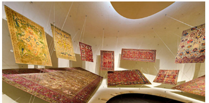
4. Clichéd contrivance: the “flying carpet” installation at the Museum of Applied Arts (MAK), Vienna

He next turned to museums’ responsibilities vis-à-vis the art in their possession. First and foremost are preservation and conservation, continuing the very existence of artworks. Other obligations are facilitating research and publication, providing appropriate public exhibition, and promoting accessibility in the broader sense—allowing people to interact in various ways with the art.