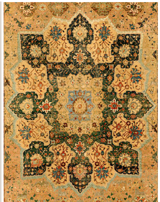
Medallion carpet (det.), Met Museum 64.311