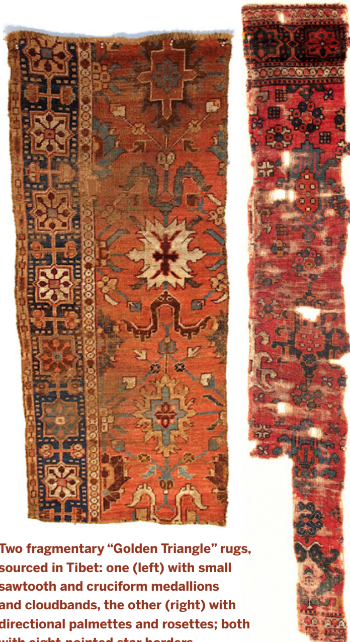
Two fragmentary “Golden Triangle” rugs, sourced in Tibet: one (left) with small sawtooth and cruciform medallions and cloudbands, the other (right) with directional palmettes and rosettes; both with eight-pointed star borders