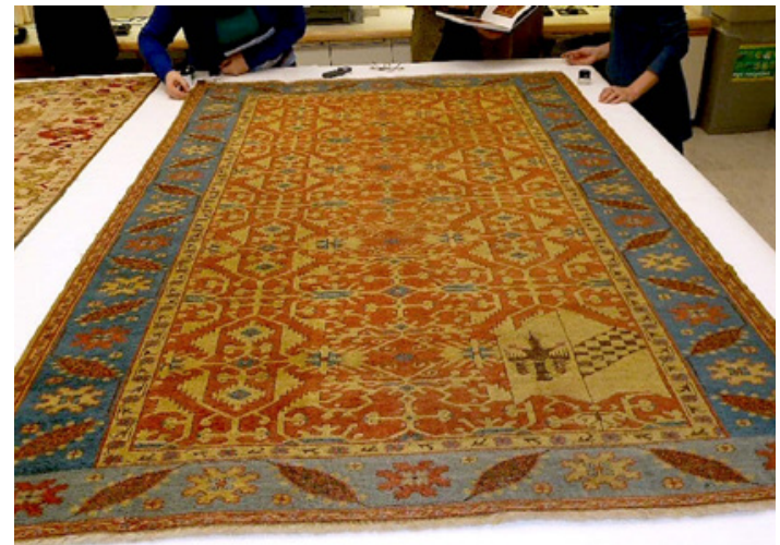
11 (top). The Valentiner Carpet, baffling Jon Thompson 12 (bottom). The McMullan armorial Lotto, a Tuduc fake

The Ballard "Aq Qoyunlu" carpet, possibly dating to the fifteenth century, is unfortunately beset with areas of poor restoration. The sixteenth-century Baker "Salting" carpet is too fragile for display: Walter saw it taken out of storage and described hearing, during its re-rolling, the "snap, crackle, and pop" of its silk warps giving way.