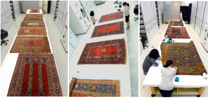
5. Views of the Antonio Ratti Textile Center, with some of the rugs stored there.