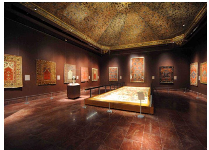
8. Innovative lighting of the Met's Spanish ceiling and the Turkish rugs then on rotation in that gallery

Carpets, Walter repeated, present museums with special challenges in meeting these responsibilities. They require space for storage and display as well as significant staffing and time for their study, care, conservation, and transportation. They require money, not just for their initial acquisition but also for care and handling once they are in a museum's collection. Their display needs extra contextual explanation, to allow visitors to understand and appreciate what they're seeing.