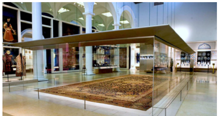
3. Costly quarters: the Ardabil Carpet’s home in the V&A