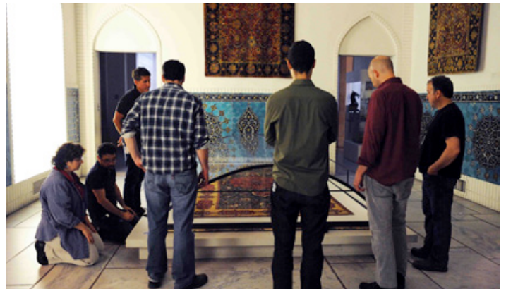
2. “Pheasant under glass”: domical display of the Marquand Carpet, at the Philadelphia Museum of Art

Carpets are often out of scale with everything else in an exhibition space; one of the most famous examples, the Ardabil Carpet in the Victoria and Albert Museum, London, is housed in a huge, light-controlled, custom glass case whose construction consumed most of the total cost of the gallery (3). Walter pronounced the “flying carpet” arrangement of the important rugs in Vienna’s Museum of Applied Arts (4) “clichéd” and “trivializing,” and illustrated how the new Islamic galleries of the Louvre have failed at addressing yet another issue—lighting.