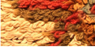
2. Partially cut loop pile of a Bohuslän rya