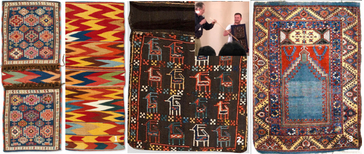
3. Central Anatolian prayer rug