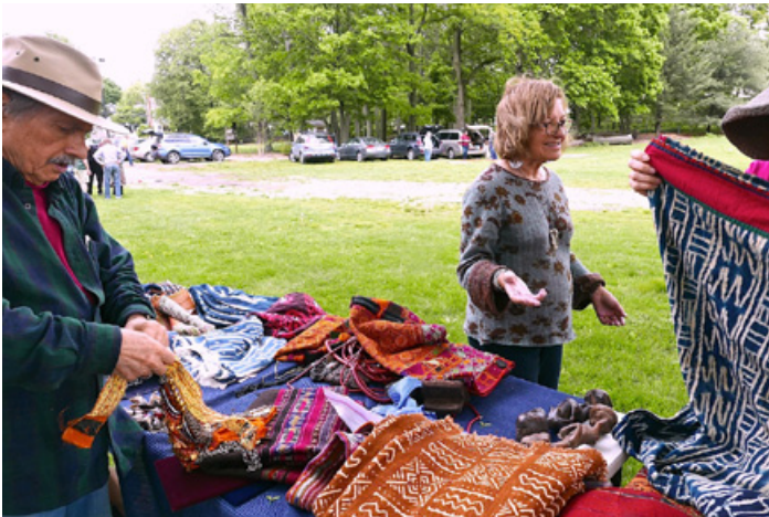
Show-and-tell (top) and moth mart at the 2018 picnic

The annual NERS picnic, the final meeting of the 2018–19 season, will be held on Sunday, May 19, at Gore Place, the lovely grounds of the former governor's mansion in Waltham. We'll again have a huge, enclosed tent with water and electricity, adjacent bathroom facilities, tables and chairs for all, and plenty of lawn space for mingling and spreading out rugs. Supply your own picnic lunch, and NERS will provide soft drinks, tea, and coffee.