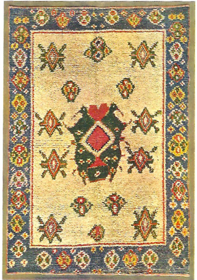
5. Bohuslän rya illustrated in Sylwan, Svenska Ryor

The knots are of standard symmetric or Turkish form, but the yarn creating the knot has been "folded" so that one side of the knot ends in the loop, and the other side in a pair of tufts (3). The tufts are buried in the mass of loops. This remarkable configuration is called a "doubled Turkish knot," but we could equally well call it a "partially cut loop knot." This knotting variant is always found in ryor having generous amounts of cotton pile.