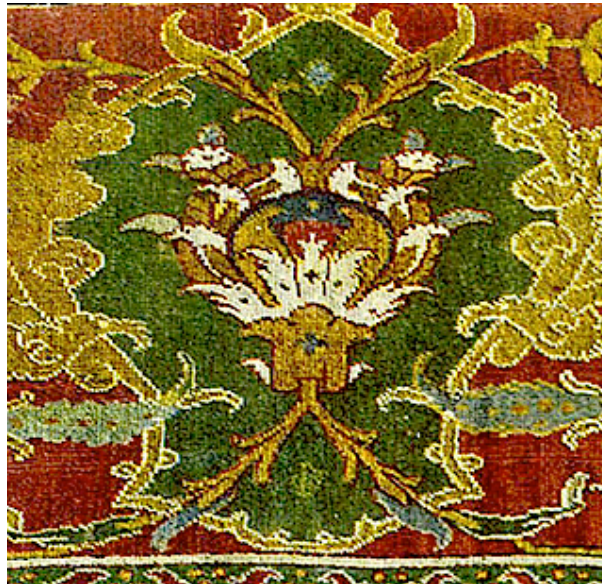
7. Border palmette on a fragmentary Ottoman Cairene carpet, Istanbul or Bursa, ca. 1600, Museum of Applied Arts, Vienna