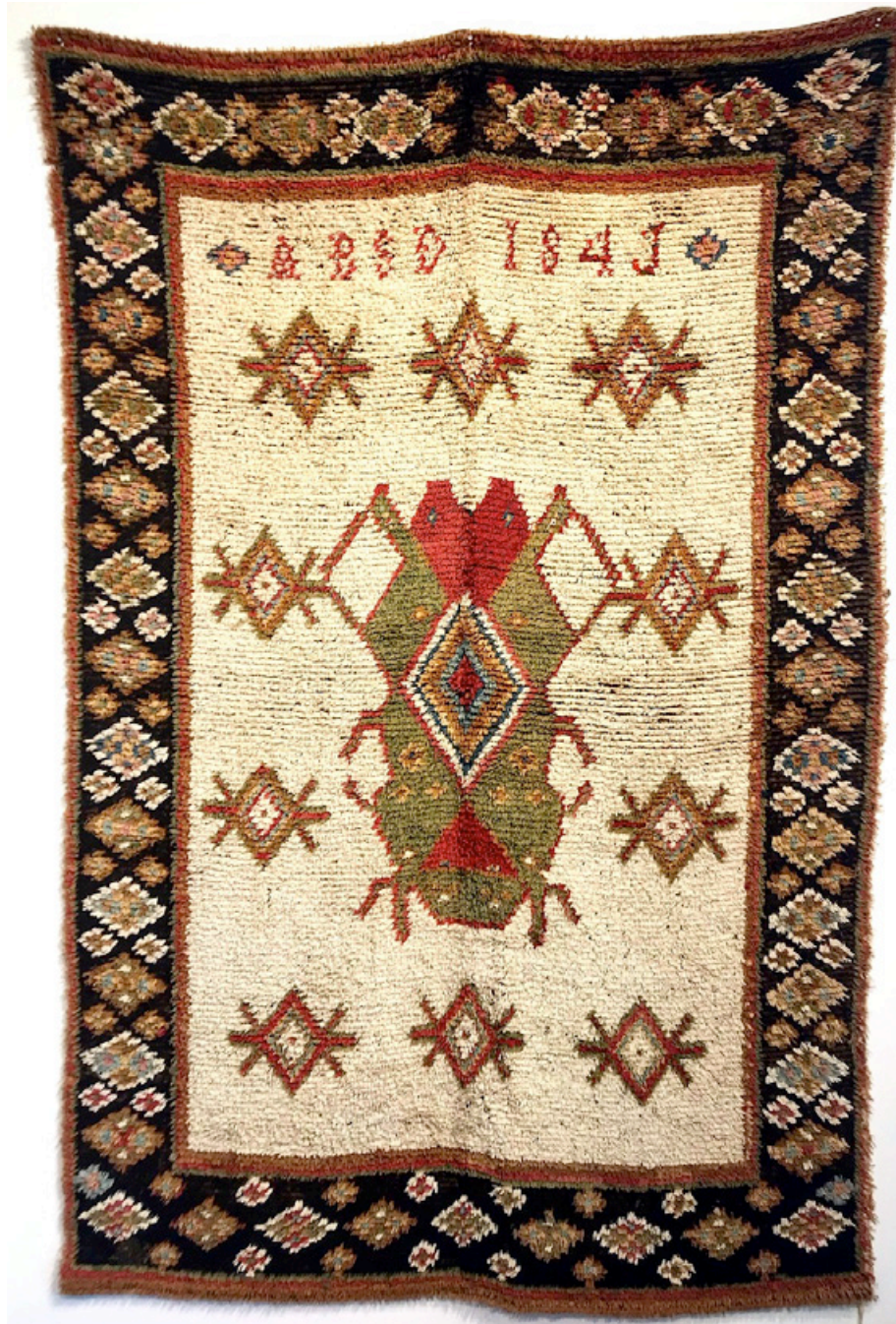
1. Decorative rya ( prydadsrya ) made in 1843 in Bohuslän, Sweden (author's collection)

Rya (plural ryor ) is the Swedish term for any Scandinavian long-pile rug. Ryor were woven throughout Sweden and Finland (which was part of Sweden from the early thirteenth century until 1809), although Viveka Hansen ( Swedish Textile Art , London, 1996) says most are from Finland. Historically, ryor were not used on the floor but as bedcovers—"sleeping rugs," if you will. From a humble origin as covers for soldiers and boatmen, they evolved into two distinct species: strictly utilitarian slitrya and decorative prydadsrya . I know of no slitryor outside a museum. Decorative ryor typically celebrated