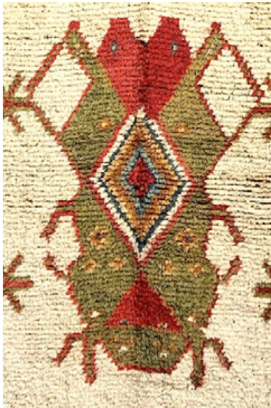
6. Detail of the central “crab” or palmette motif on Lloyd’s 1843 Bohuslän rya