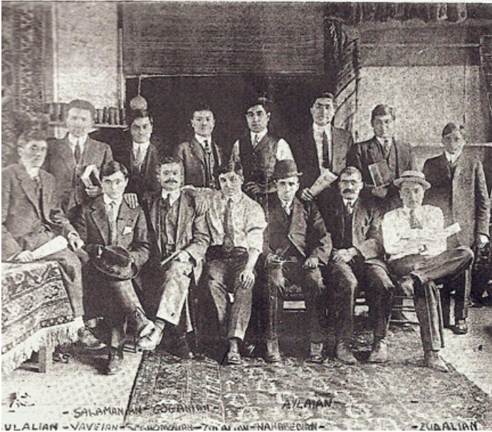
3. Armenian rug dealers of Boston, in an undated photo