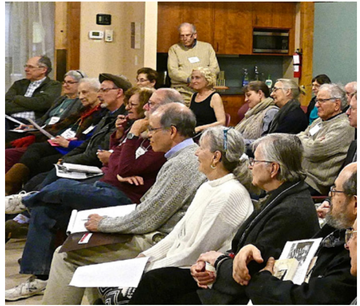
4. A member offers a bleak view of future rug collecting