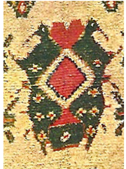
8. Detail of the central motif on the undated Bohuslän rya illustrated by Sylwan

Bohuslän’s decorative ryor are sufficiently unusual that Sylwan devotes one of her six chapters (p. 120 ff.) to these rugs alone. As a consequence we can answer, at least in part, the obvious question: how did Bohuslän ryor achieve this unique position? The presence of cotton is most easily explained. The fibers used in ryor are wool, flax, hemp, and cotton. Of these, only cotton is not native and must be imported. Until the late nineteenth century, importation was restricted to certain “staple ports” such as Stockholm and Göteborg, and imported goods were subject to high tariffs; an expensive, exotic product like cotton was therefore a prestige item in the peasant household. The reason cotton appears in abundance in Bohuslän and only in Bohuslän is almost certainly that the province, located at the North Sea mouth of the Skagerrak and possessing Sweden’s largest archipelago after Stockholm, offered unparalleled opportunities for smuggling.