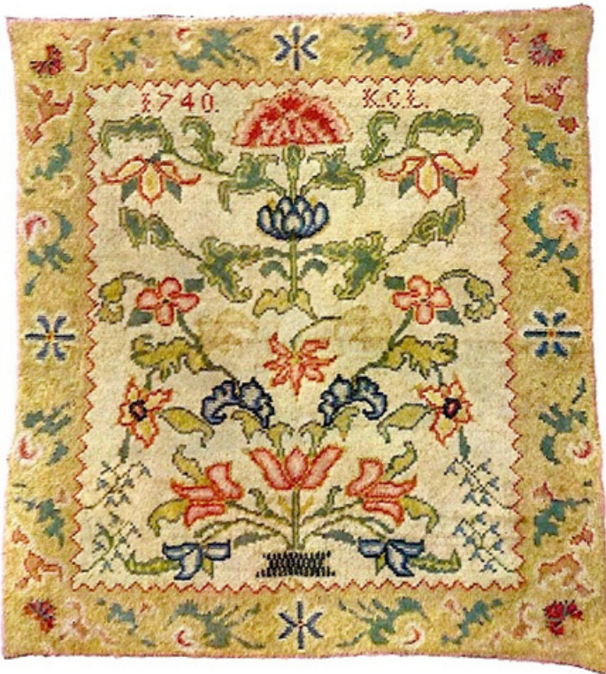
4. Decorative rya with floral design, 1740

number of weft shoots between knot rows—rugs with up to two dozen (!) are known. The weaving technique is likewise common among ryor ; it is very similar to that of julkhyrs in leaving almost none of the design visible on the back.