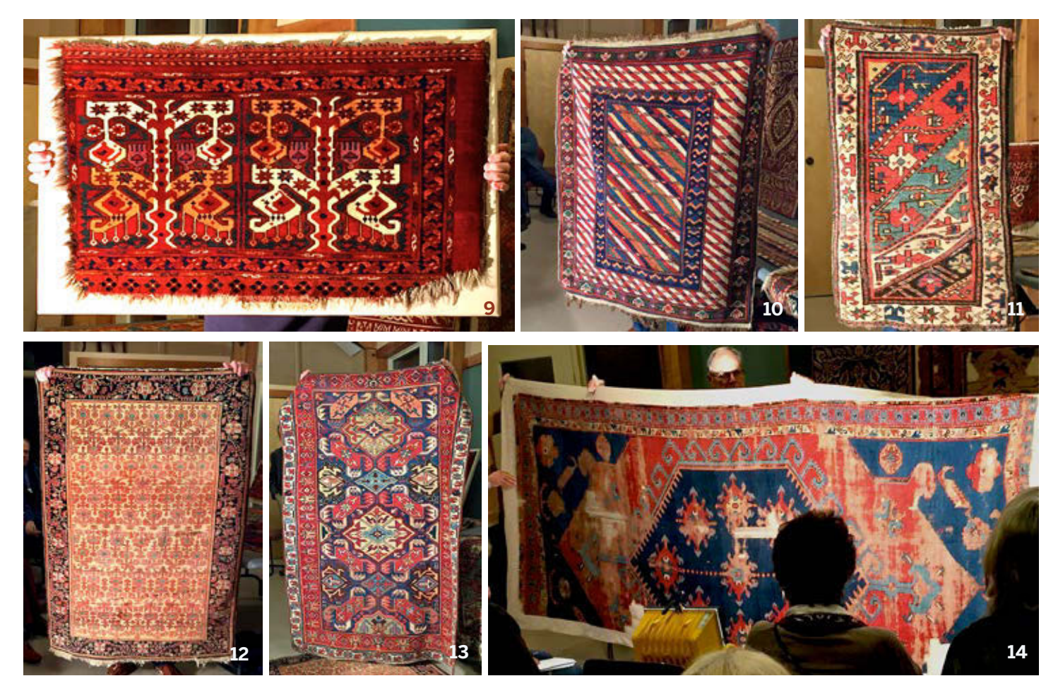
Pile rugs at the show-and-tell: fragmentary Ersari Turkmen trapping (9), Caucasian Shirvan (10) and Gendje (11) rugs, Jozan Sarouk (12), Alpan Kuba (13), and non-textile-derived old Turkish carpet (14)