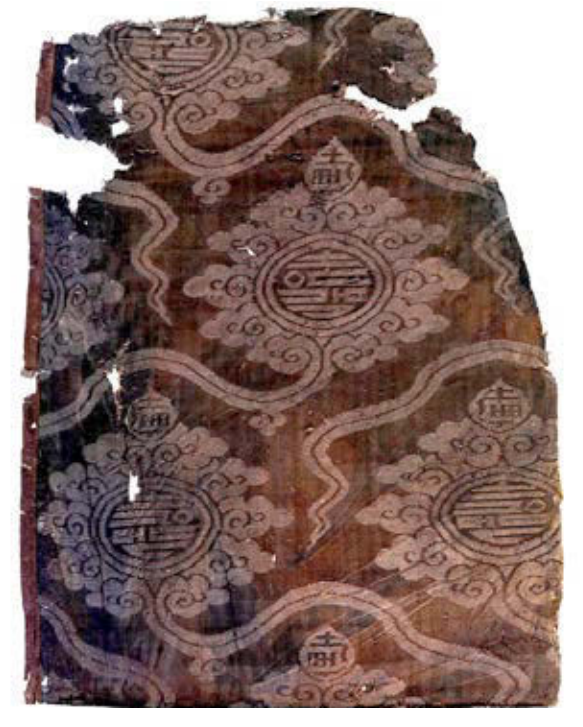
2 Silk damask fragment, China, Yuan period, ca. 1300, Metropolitan Museum 35.56.20

To begin, Gerard compared the motifs of a Yuan-period Chinese silk damask (2) to similar ones on a Turkish "Seljuk" carpet made not much later (3). That the pile version was less curvilinear reflected the differences in materials and weaving technique. Overall, he noted, the textile-weaving process favored small, repeating patterns, as seen in the Seljuk rug. In contrast, the geometric designs of Turkish "compartment and gul" carpets, such as small-pattern Holbeins, were in his opinion less likely to have been derived from textiles.