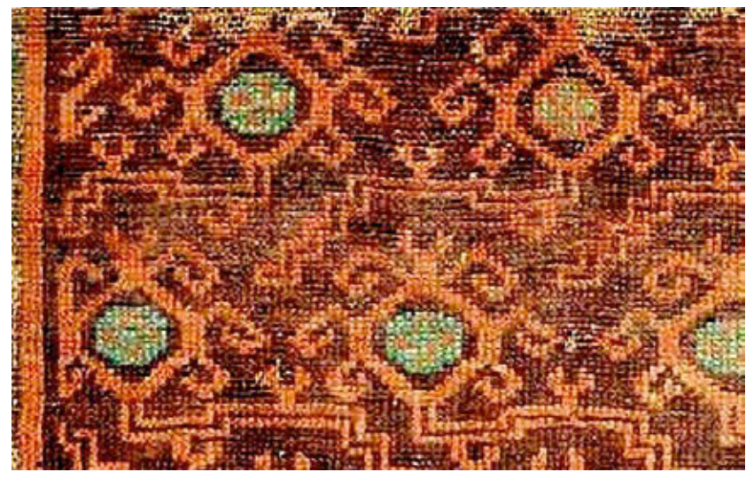
3. Fragmentary Turkish carpet (detail), early 14th century, Turkish and Islamic Arts Museum inv. no. 688