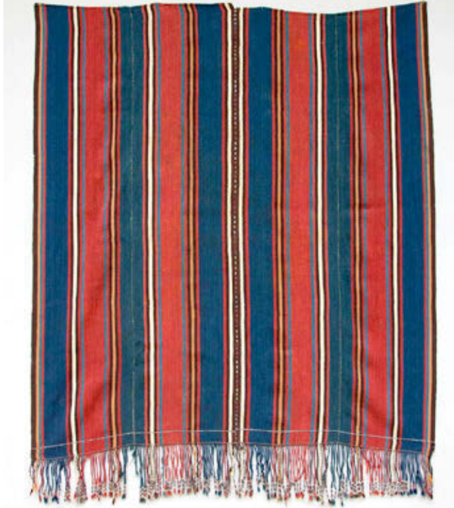
8. Jajim made as a horse cover, Baku