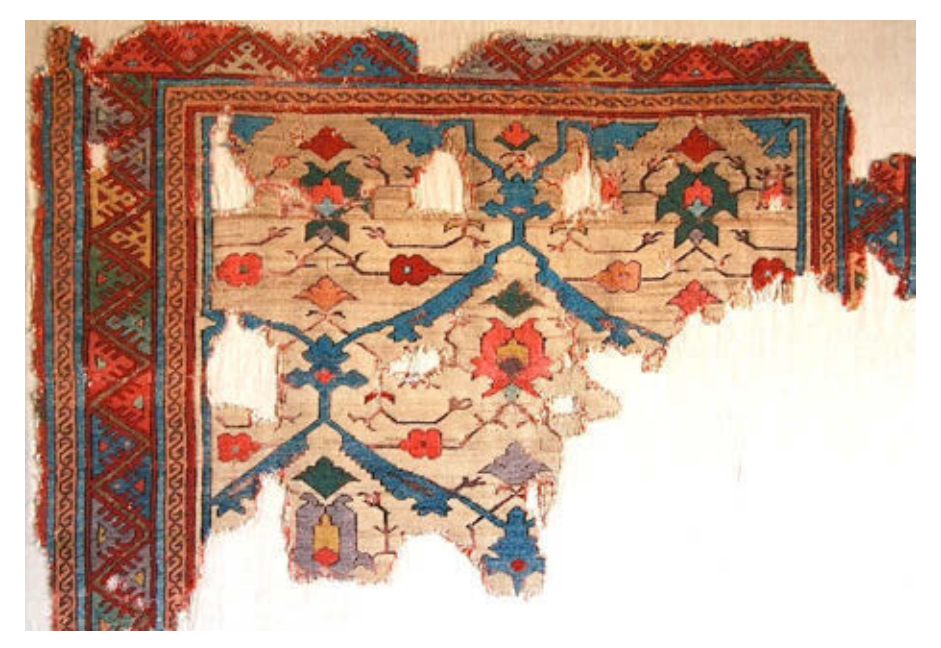
5. Rug fragment with rumi lattice, 16th century or earlier, Paquin Collection

Gerard then considered other artistic media that rug designs might have come from. Although the making of architectural tiles and fine manuscripts was long established