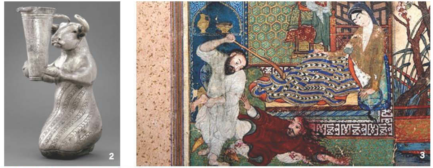
2. Silver bull figurine, Southwest Iran, ca. 3100–2900 BCE, Metropolitan Museum 66.173 3. Detail of "A Thief Beaten in the Bedchamber," painting from a Kalila wa Dimna , Tabriz, ca. 1370–74, Istanbul University Library F. 1422, fol. 24a

Several millennia more recently, a Persian manuscript painting of about 1370 depicts a woman in bed, awakened by two men fighting; her coverlet is vertically striped and geometrically patterned in a manner unmistakably suggesting a jajim (3). This image led Mike to an explanation of why existing jajims are not much collected: although they're big—typically six by eight feet—they're made not to be walked on but rather as bed and pack covers.