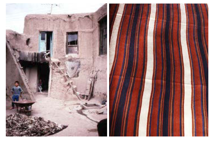
4. House in Qarajeh, and detail of a jajim made by the owner's great-grandmother