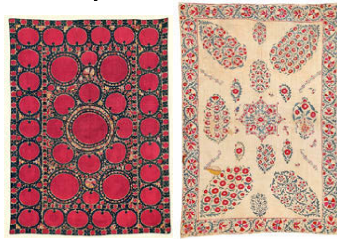
4. Suzanis from Tashkent (left) and Nurata (right)

Ali then characterized suzanis according to seven areas in which they were produced. The first was Bukhara, the richest city in central Asia in the nineteenth century, with a mix of Uzbek and Tajik populations. On linen or cotton grounds, Bukhara suzanis are embroidered using a flat ( basma ) stitch, and sometimes a chain stitch. Oldest among them are suzanis with dominant, "archaic" central medallions. Gradually the size of these medallions was reduced, providing more space for border development and the inclusion of other field motifs ( 3 ). Experimentation with other forms, such as lattice variations and tree-of-life designs, followed. Ali attributed these changes to the Bukharan economic boom and the floral taste of buyers in Persia and Mughal India.