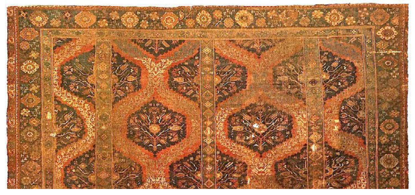
4. Wool knotted-pile carpet with textile-panel format, 17th century, Vakıflar (Istanbul Carpet Museum) no. E-110

Gerard then showed a sixteenth-century Ottoman brocaded silk textile with repeated ogival forms containing tulips, carnations, and hyacinths. A seventeenth-century pile carpet featured similar floral forms; in addition, its field was divided by vertical bands, so that it echoed textile loom widths, their selvages intact, joined together to make a panel (4).