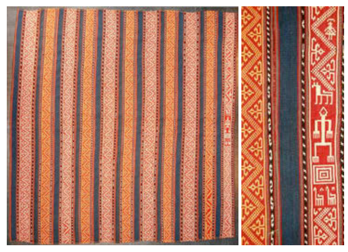
6. Figural jajim from Saveh, Iran (whole view and detail)

He then illustrated a silk jajim (7). Although he had seen such pieces being taken off quilts from Shekki, he acknowledged that sericulture was established and widespread throughout the Caucasus.