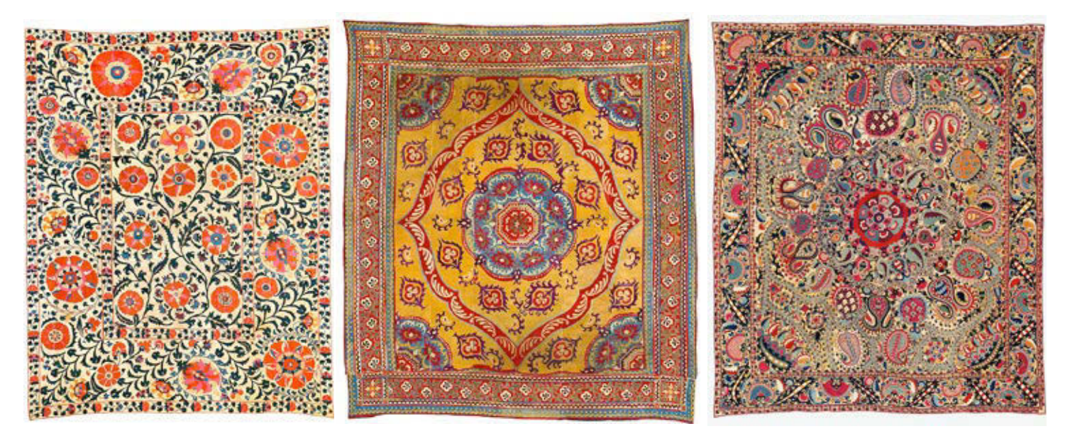
6. White-ground Shahrisabz suzani of Ali's first type