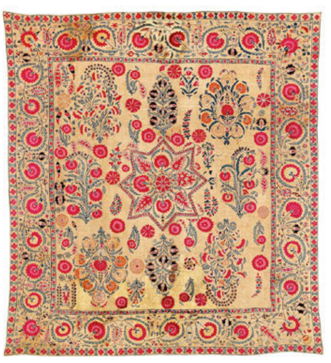
5. Ura Tube suzani

The second suzani-producing region was Tashkent, the capital of Uzbekistan, with an Uzbek-majority population. Wealthy during the eighteenth century, Tashkent was annexed by Kokand in the early 1800s and by Russia later in the century. Tashkent suzanis, much less varied than those of Bukhara, have a design vocabulary of red circular forms on red or white backgrounds (4 left) .