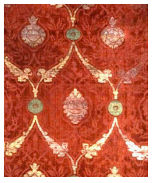
6. Length of Ottoman brocaded velvet (detail), 16th century, MFA 04.1628