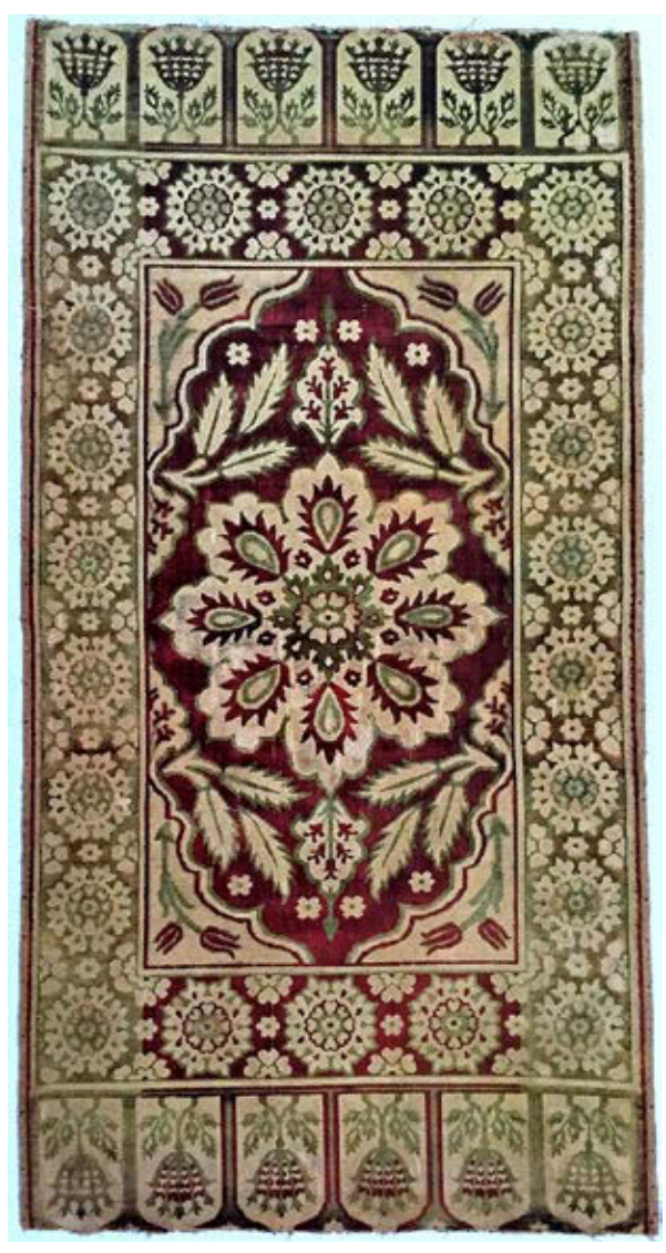
7. Velvet yastık, 17th century, GWU Textile Museum 1.79

Gerard Paquin on Textile Designs in Turkish Rugs, cont.