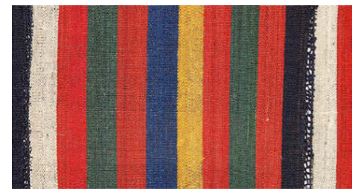
9. Detail of a Chahar Mahal jajim made as a brazier cover