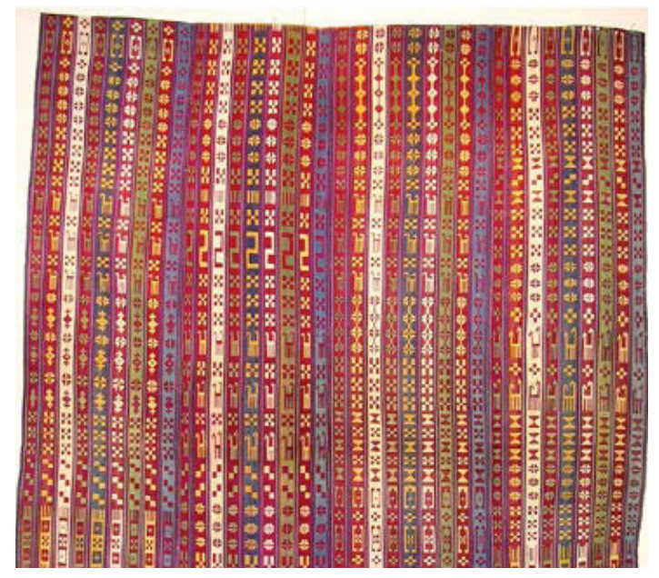
7. Silk jajim (detail), probably Shekki, Azerbaijan