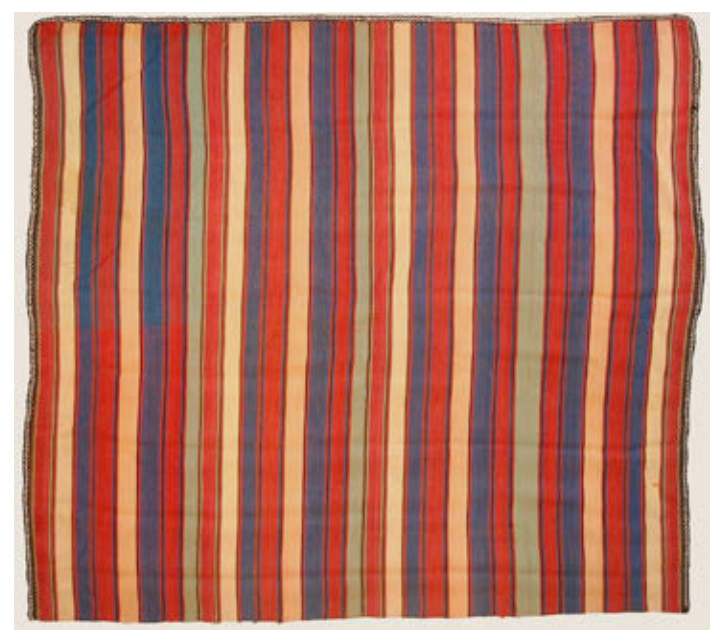
5. Transcaucasian jajim with Mike's preferred color range

After illustrating jajims with plain stripes, he showed many with geometric designs within the stripes: although more challenging to weave, these are relatively common. In a rarer example, abstract motifs were supplemented by human figures and animals that Mike identified as dogs (6) .