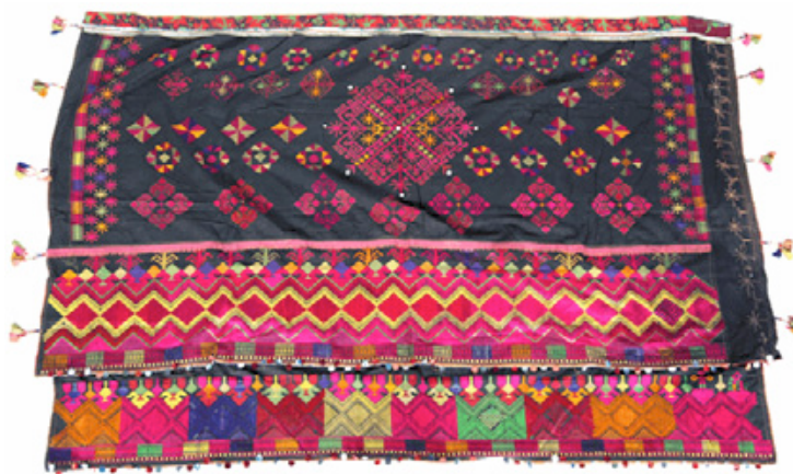
12. Abochhini (woman's wedding shawl), Swat Valley