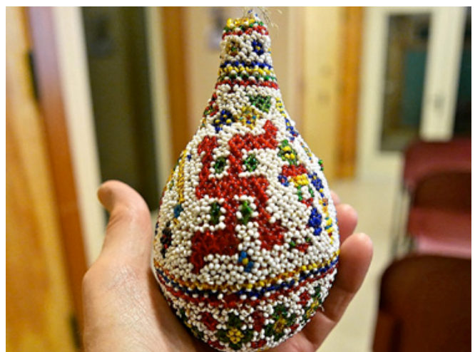
7. Bottle beaded over a coconut, Sindh-Gujarat border