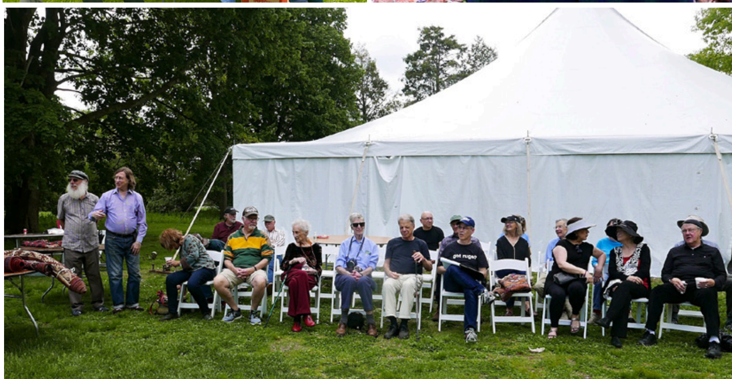
Members shop the moth mart and, after picnicking, take their places for the show-and-tell