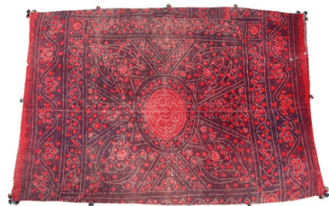
9. Ajrak cloth used as the back of the ralli shown above