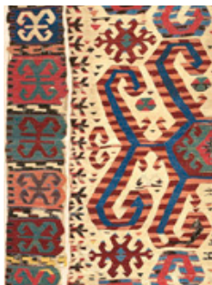
Western Anatolian kilim (detail), 1750–1800, TM