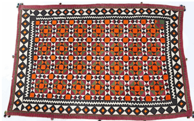
8. Ralli (quilt), Chauhan group, Sindh