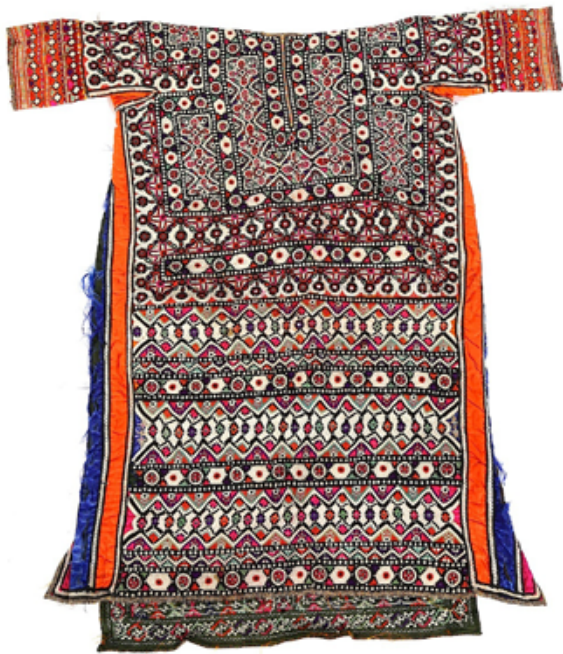
4. Thano Bula Khan guj (woman's wedding dress)

Also from Sindh was a "belly piece" from a woman's blouse (5). Embroidered in silk with small mirror elements on a black cotton ground, it came from either the Dars