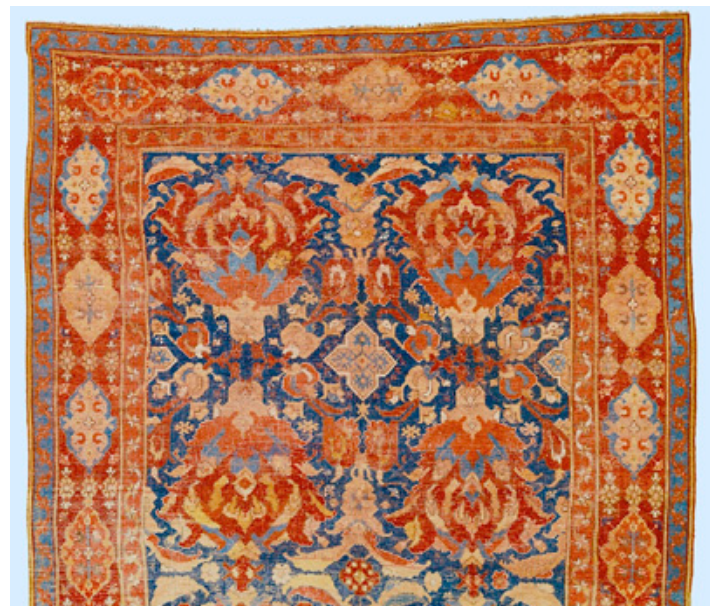
2. Detail of a Smyrna carpet sold at Sotheby's in 2014