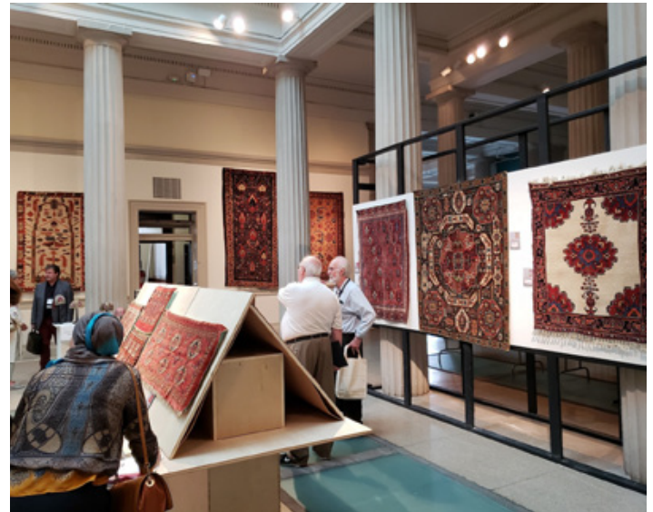
6. More privately owned rugs and textiles displayed at the Corcoran for the duration of ICOC