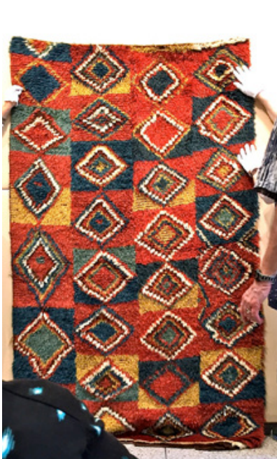
7. Diamond-design Uzbek julkhyr (sleeping rug)