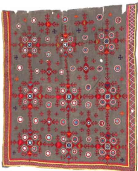
5. "Belly piece" from a woman's blouse, Sindh