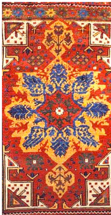
Knotted-pile Turkish yastik (detail), 19th century, Paquin Collection