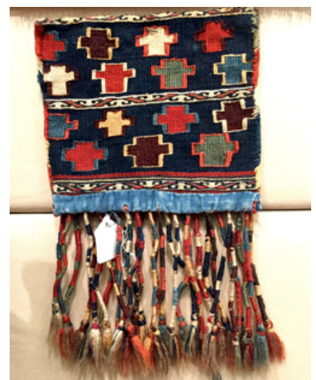
9. Small, tasseled, bottom-opening Shahsavan flatwoven pouch, perhaps made to cover the teeth of a weaver's beating comb