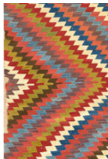
Central Anatolian kilim (detail), 19th century, TM