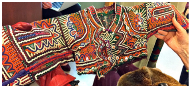
6 Boy's jacket, Rajasthan

The Simons next presented items from the hybrid area of Sindh, Rajasthan, and Gujarat, spanning the Pakistan-India border. They started with a Rajasthani boy's jacket (6) and a small bag utilizing the same stitch as the jacket. A dagger belt featuring stylized scorpion motifs was followed by a set of cuffs embroidered in metal thread. Next came a bottle, beaded over a coconut, whose decoration included a swastika (7)—an ancient Hindu design long predating the Nazi version of the motif.