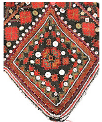
14. Shin child's vest and baby's hood (detail), Indus Kohistan