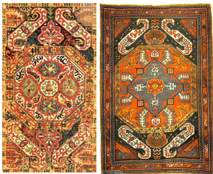
3. Azerbaijan embroidery, formerly Kirchheim Collection, compared with a Kasim Ushag rug offered on rugrabbit.com

The morning session ended with Michael Lubin and Bethany Mendenhall’s “Anatolian Kilims: Why Fragments?” with an enormous parade of spectacular pieces, mostly from their own collections. I was bright green with envy. Their answers to the question posed by their title can be summarized as follows: First, fragmentary kilims are a lot more common than intact ones. Second, intact kilims are typically enormous, so it is difficult to display them. Finally, with fragments you can pretend to be a serious tapetologist, when all you really care about are those eye-dazzling colors (4).