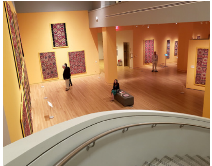
2. Goldman-gift Uzbek ikat panels on exhibition at the Textile Museum