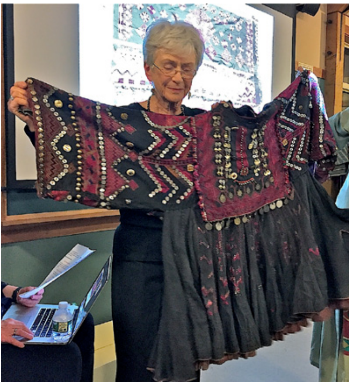
13. Woman's dress with multiple gores, Indus Kohistan