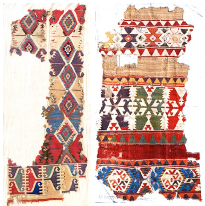
4. Anatolian kilim fragments offered on rugrabbit.com