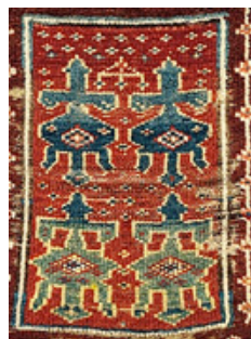
1. Western Anatolian yastik (detail), ca. 1800