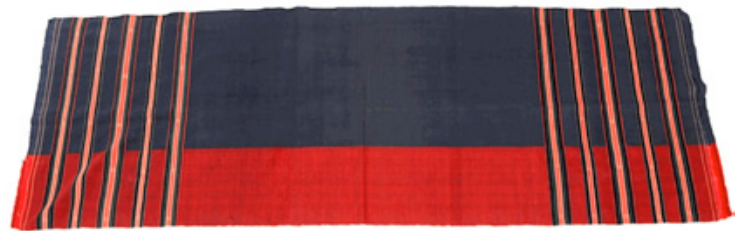
10. Pashtun man's shawl, Waziristan

The third region represented in the Simons' collection was Punjab, a populous and comparatively rich area of eastern Pakistan and northern India. Among its textiles, Punjab is most famous for phulkari embroideries, most commonly made as shawls and head scarves. The first examples, a shawl and a pillow cover, were possibly from the Hazara Division, to the north. Next were two shawls from the Punjab proper, one of which Peggy modeled (11). The other, dating between 1870 and 1890, featured parrots in the design. Last was a recently