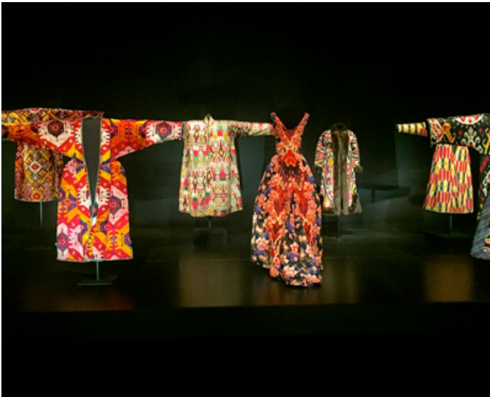
1. Uzbek ikat robes donated by Guido Goldman, shown with Oscar de la Renta adaptations, at the Freer/Sackler

In contrast to the unevenness of the academic program, a beautifully installed exhibition, mounted at GWU’s Corcoran