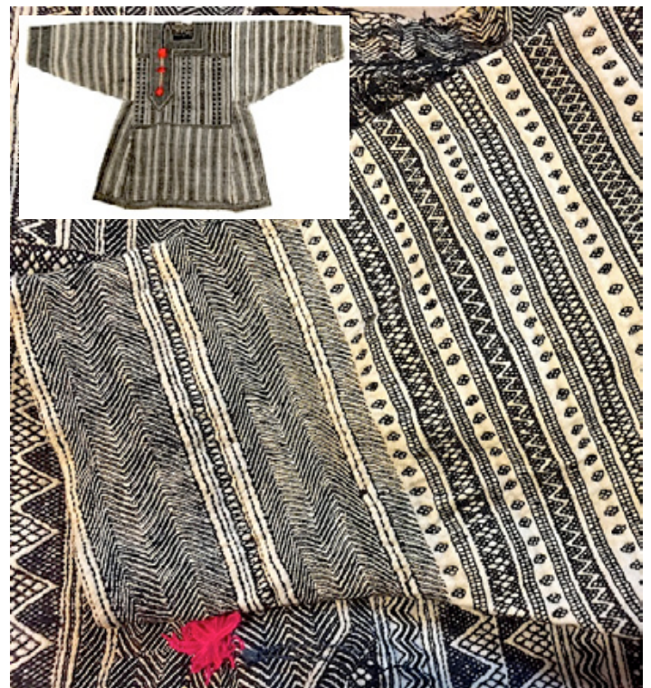
15. Nuristan boy's tunic, front (inset) and sleeve detail