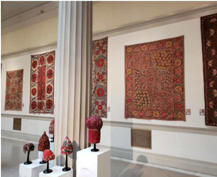
5. A wall of spectacular suzanis from private collections, shown at GWU's Corcoran School of Arts and Design