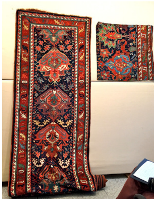
8. Sauj Bulagh long rug and carpet fragment