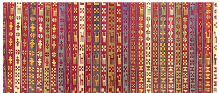
Detail of a silk jajim, Shekki (Azerbaijan)

Food: Provided by members whose names begin with A through G . Please arrive before 6:45 to set up, and plan to stay afterwards to clean up.