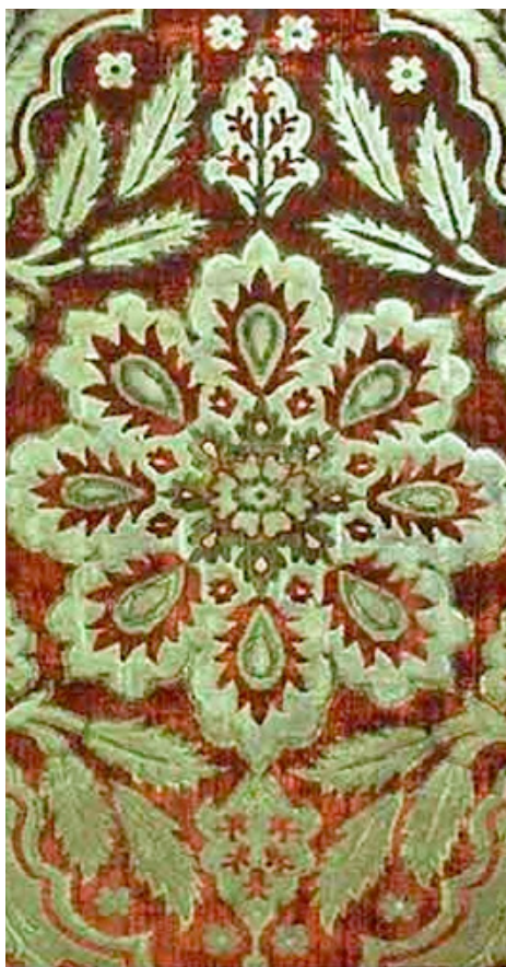
Ottoman velvet yastik (detail), 17th century, Textile Museum