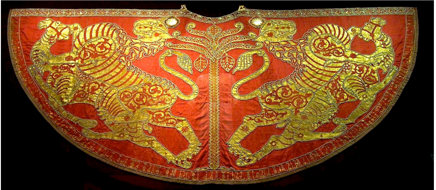
3. Mantle of King Roger II of Sicily, silk samite with embroidery, pearls, and gems, 1133 CE, Kunsthistorisches Museum, Vienna