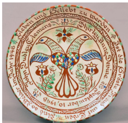
7. Plate, Pennsylvania (?), 1948