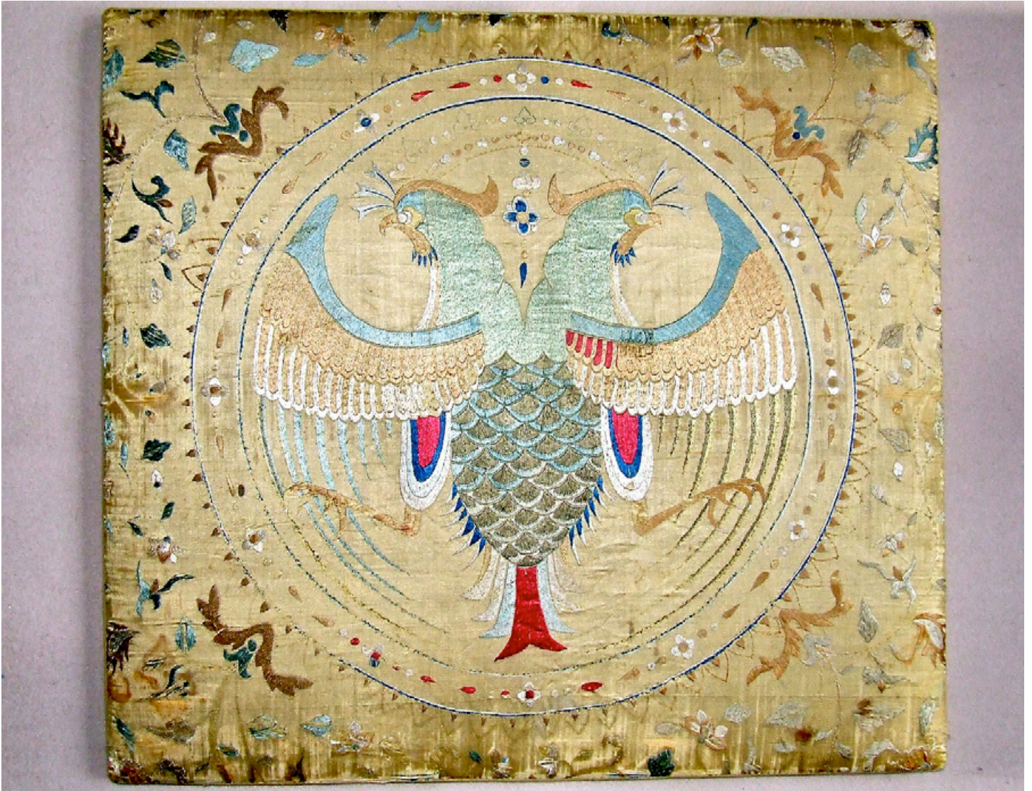
1. Portuguese silk-on-silk embroidery with double-headed eagle in roundel, second half 17th c.

The double-headed eagle motif shown in the Portuguese silk-on-silk embroidery above (1) goes back at least to the eleventh century, and possibly earlier.* It is, for example, tempting to regard the frontally presented eagle in a seventh-century samite fragment from Central Asia (2) as a precursor of the motif (also note the skull!). The double-headed eagle was originally an Islamic symbol of authority and power, and rapidly spread both east and west (3). We see the same motif in the Byzantine Empire; a fourteenth-century Golden Bull shows the Empress Theodora Kantakouzene of Trebizond wearing a brocaded robe with a double-headed eagle repeat (4). In Central and Eastern Europe the motif descended from Byzantium to become the familiar double-headed eagles of the Habsburg and Russian empires. Some textiles found in Al-Andalus, either made there or imported from Byzantium, feature the motif as well: see, for instance, a detail of an