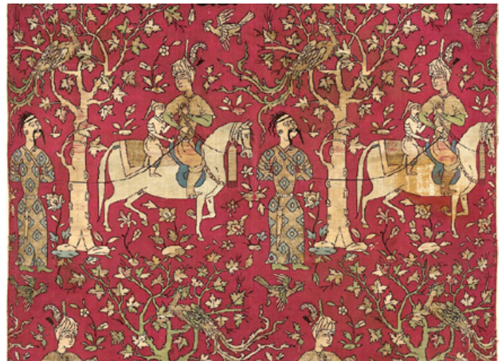
5. "Prisoner" silk (detail), metal-brocaded lampas, Iran, mid-16th century, Metropolitan Museum of Art

After the Mongols conquered Iran and Iraq in the thirteenth century, their preferred textiles were dazzling