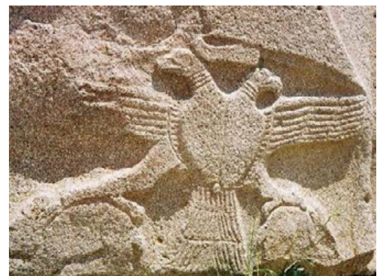
8. Hittite eagle, Sphinx Gate at Alaca Hüyük

eleventh-century wall hanging from the San Zoilo Monastery in Palencia (5). Shortly after the Reconquista (1492), the Habsburgs acquired Spain, and later Portugal as well (1580). In 1640 Portugal, led by João I of Braganza, rebelled against Spanish rule and finally, in 1668, won its independence from Habsburg rule.