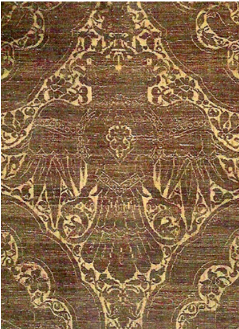
3. Lampas (detail), Northeast Iran, 13th c.