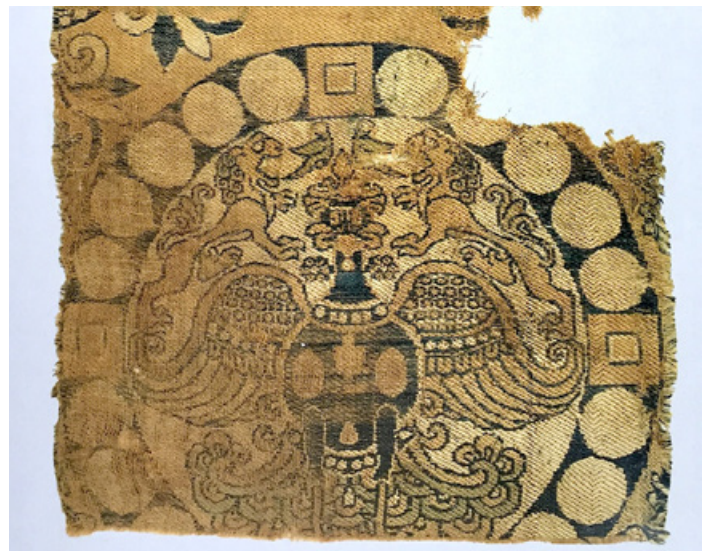
2. Samite fragment (detail), Central Asia, 7th century

The double-headed eagle motif shown in the Portuguese silk-on-silk embroidery above (1) goes back at least to the eleventh century, and possibly earlier.* It is, for example, tempting to regard the frontally presented eagle in a seventh-century samite fragment from Central Asia (2) as a precursor of the motif (also note the skull!). The double-headed eagle was originally an Islamic symbol of authority and power, and rapidly spread both east and west (3). We see the same motif in the Byzantine Empire; a fourteenth-century Golden Bull shows the Empress Theodora Kantakouzene of Trebizond wearing a brocaded robe with a double-headed eagle repeat (4). In Central and Eastern Europe the motif descended from Byzantium to become the familiar double-headed eagles of the Habsburg and Russian empires. Some textiles found in Al-Andalus, either made there or imported from Byzantium, feature the motif as well: see, for instance, a detail of an