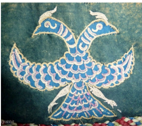
6. Rasht inlaid textile (detail), 19th c.