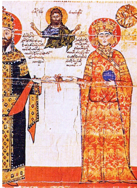
4. Golden Bull (detail), Trebizond, 14th c.