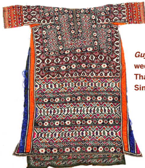
Guj (full-length wedding dress), Thano Bula Khan, Sindh

Food: Provided by members whose names begin with R through Z . Please arrive before 6:45 to set up, and plan to stay afterwards to clean up.