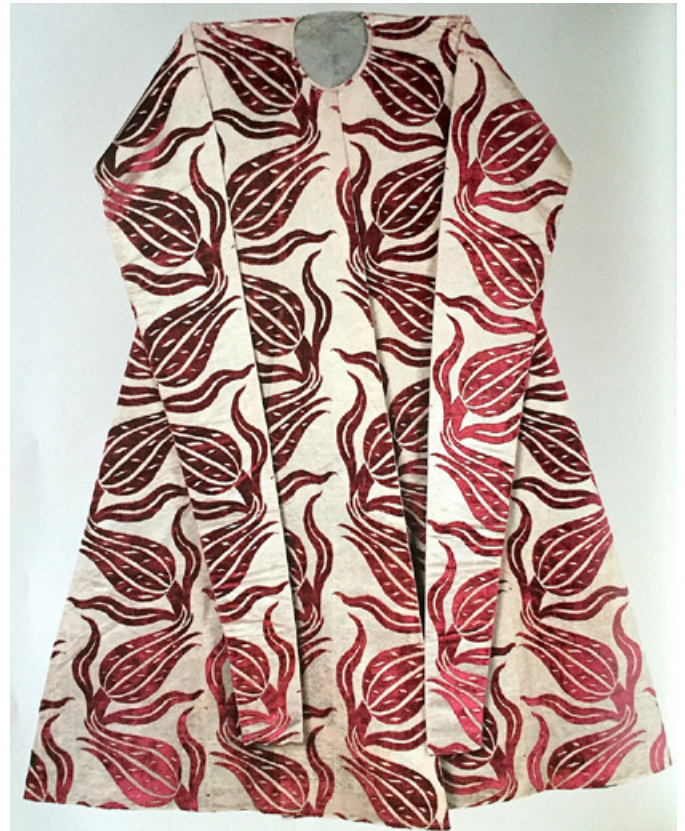
7. Ottoman robe made from Italian velvet, 3rd quarter 16th century, Topkapı Saray Museum

Louise pointed out that prestigious Islamic textiles often reflected not only artistry but also complex economic trade relationships. In the fifteenth and sixteenth centuries, for example, raw silk originating in Iran was shipped to Ottoman Bursa, where it was graded, taxed, and sold to Italian silk merchants. Subsequently, many Italian-made velvets adorned with Ottoman designs were exported from Italy to Turkey to meet a huge demand from the Ottoman court (7).