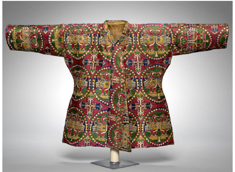
2. Prince's coat with ducks in roundels, silk samite, Eastern Iran or Soghdia, 8th century, Cleveland Museum of Art