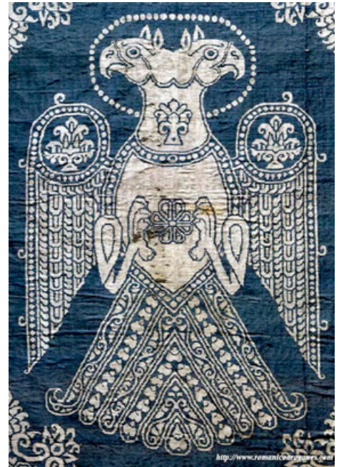
5. Wall hanging (detail), Palencia, 11th c.