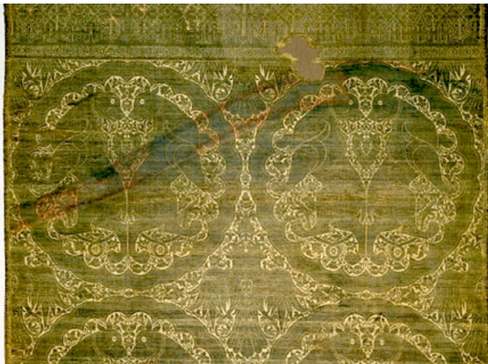
4. "Cloth of gold" (detail), silk-and-gold-thread lampas, Northeast Iran, mid-13th century, Cleveland Museum of Art

Moving west, to lands where there was enormous wealth from the ninth to the twelfth century, Louise showed a Yemeni ikat with tiraz inscriptions in gold leaf, dated to 961 CE, in the Cleveland Museum collection. Then, with the rhetorical question, "How spectacular can spectacular be?," she turned to Sicily, where a brilliant red-and-gold mantle, made in 1133, was produced in an Arab-founded royal manufactory for Norman king Roger II (3). This garment, with its lion-and-camel imagery and lavish materials (including hundreds of pearls), became the coronation robe of the Holy Roman emperors.