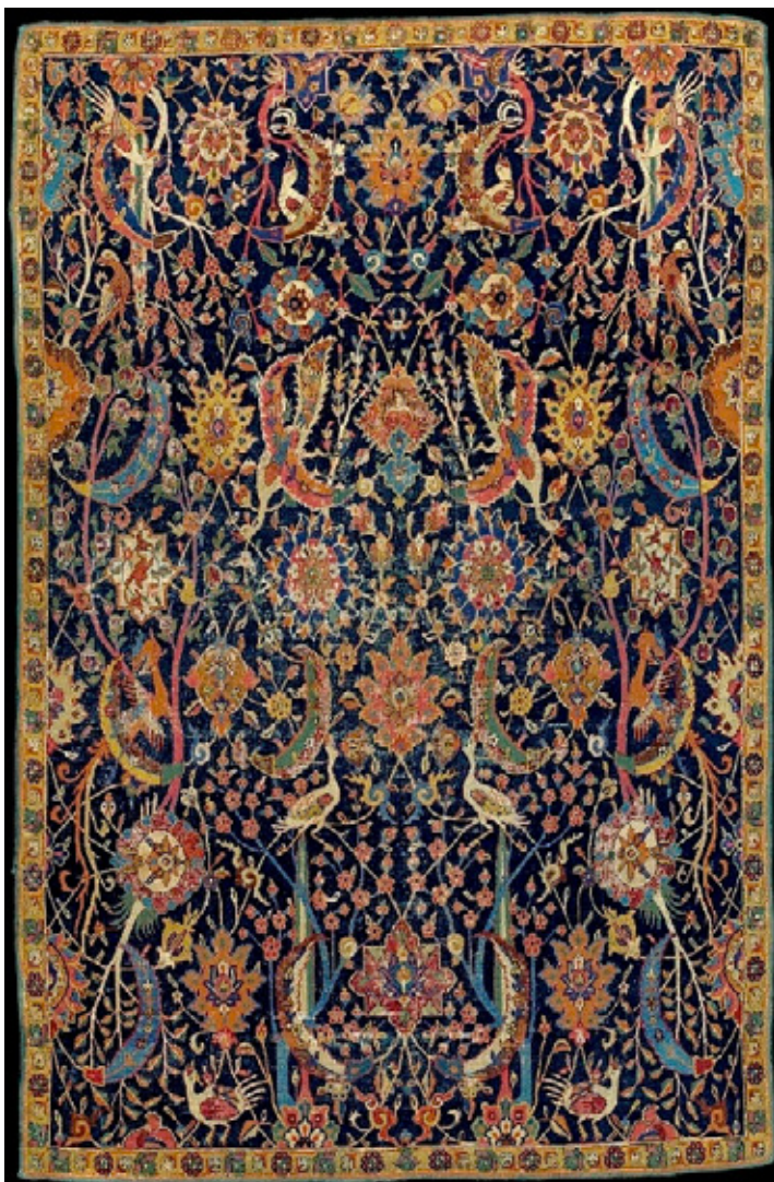
3. Lot 102, incomplete "vase" carpet with birds, 10' 1" x 6' 5", estimated £400,000–600,000, sold for £794,500

In June 2013, the so-called Corcoran sickle-leaf rug, a smallish but superlative "vase" carpet, fetched a stratospheric $33,765,000 at Sotheby's (see View from the Fringe , Sept. 2013, p. 7). Admirers of Safavid-era carpets hence took note of Christie's April 19 offering of three more "vase" rugs, all unpublished and boasting a gilded Rothschild provenance ( www.christies.com/lotfinder/salebrowse.aspx?intsaleid=25991&viewType=list ). This time around, prices, although substantial, didn't soar. A red-ground fragment with ebullient palmettes (1) sold for £542,500. (The MFA, Boston, has another piece of the same once-vast carpet.) An intact rug, its relatively spare field dominated by sawtooth leaves (2), brought £962,500, less than Christie's low estimate. The oldest and rarest of the trio, with fanciful birds perched among its multi-layered flora (3), showed substantial wear and was missing its outer borders; bidders nevertheless pushed it to £794,500.