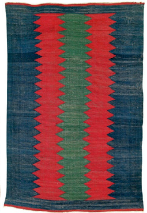
"Overachievers" from the second Vok Collection sale at Rippon Boswell, Wiesbaden, held on March 12, 2016