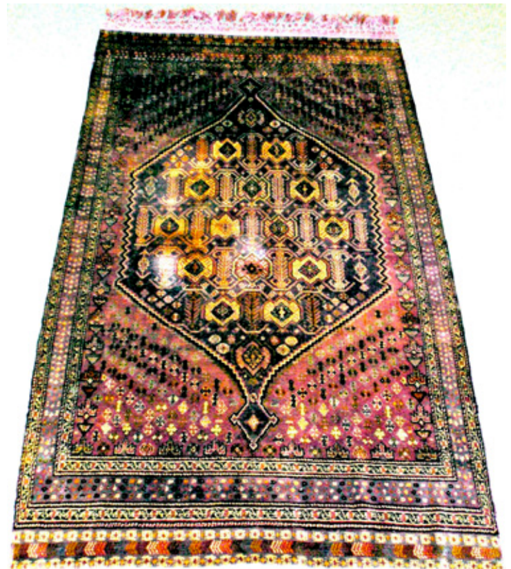
9. Silk rug woven by Armenian women in Yokohama, Japan, 1920–21