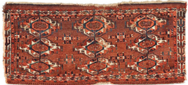
3. Yomud torba , lot 38 at Skinner's March 13 sale

Asia (originally titled Carpet Magic ), which he heartily recommended, calling it "the best book ever written on rugs."