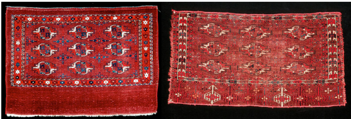
7, 8. Yon Bard's examples of a typical (left) and a "good" (right) Yomud chuval

tremendous variety, particularly compared with Salor three-gul chuvals or Tekke torbas .