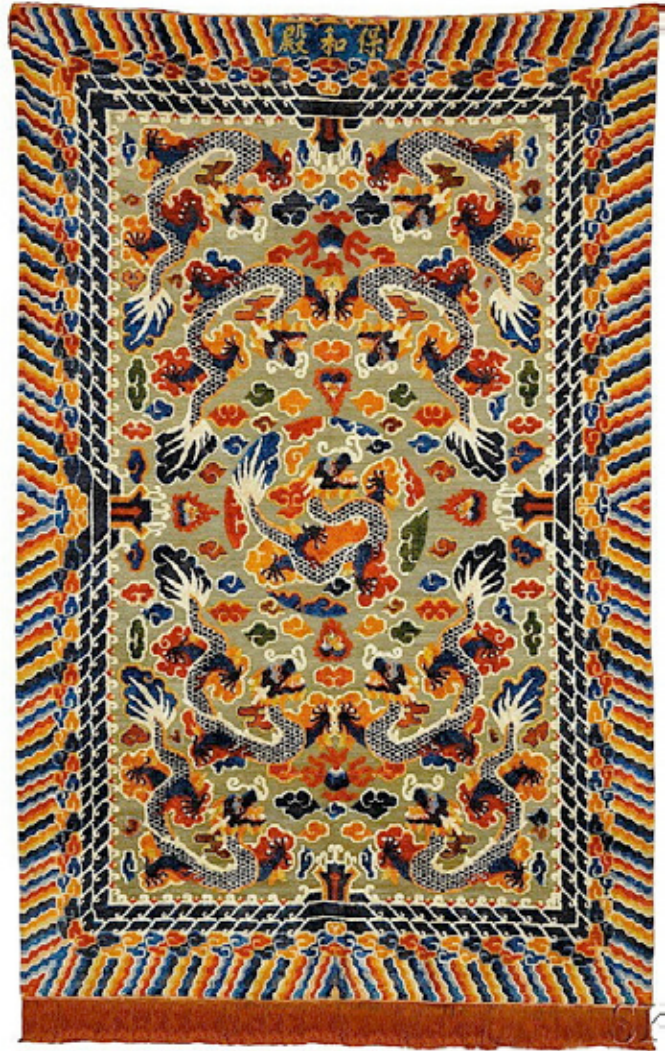
5. Chinese silk and metal-thread carpet, lot 87, the top lot ($28,290 with premium) at Skinner's March 13 sale

By contrast, urban or workshop rugs were made with the aid of designs drawn on paper; Lawrence showed a photo of workers in a design studio coloring in a pattern. This multistep process made designers more prestigious and weavers less so. In fact, for one type of workshop product—Kashmir shawls—both design and production