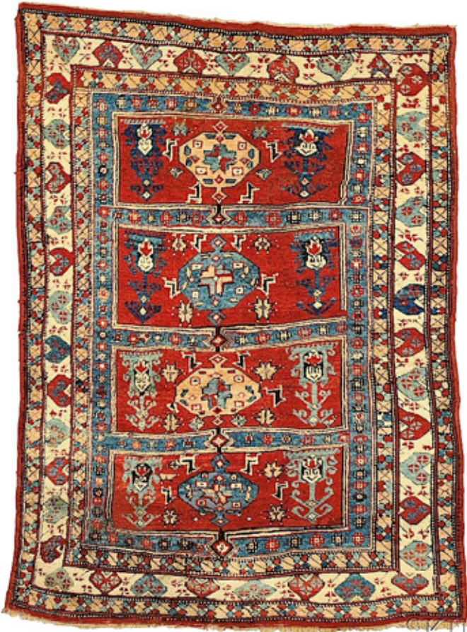
4. West Anatolian rug, lot 41 at Skinner's March 13 sale

weavers of village rugs and textiles made them not for their own use, but rather to sell to others. Rug weavers therefore were not necessarily using the designs of their mothers and grandmothers, but rather what the market dictated. Again picking examples from the Skinner sale, Lawrence showed a West Anatolian village rug (4), Kazak rugs, a Shirvan prayer rug, a Talish runner, a Kazak bagface, a Swedish needlepoint cushion cover, a Bijar rug, and a Bakshaish rug.