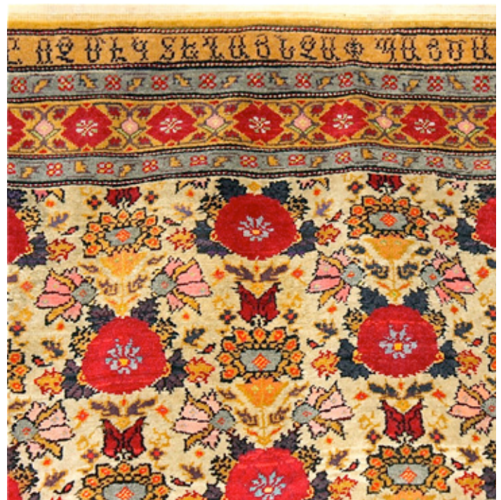
6. Gyumri Rug on display at ALMA in 2014: whole view and detail showing a small section of the Armenian inscription