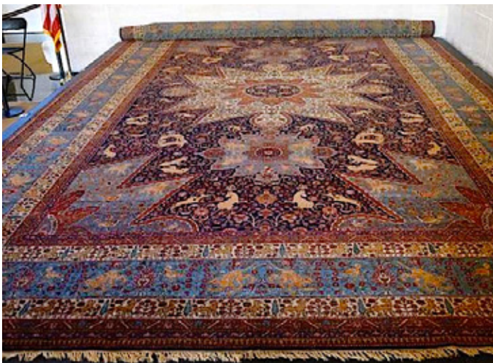
8. The Coolidge Orphan Rug on brief display at the White House Visitor Center, November 2014