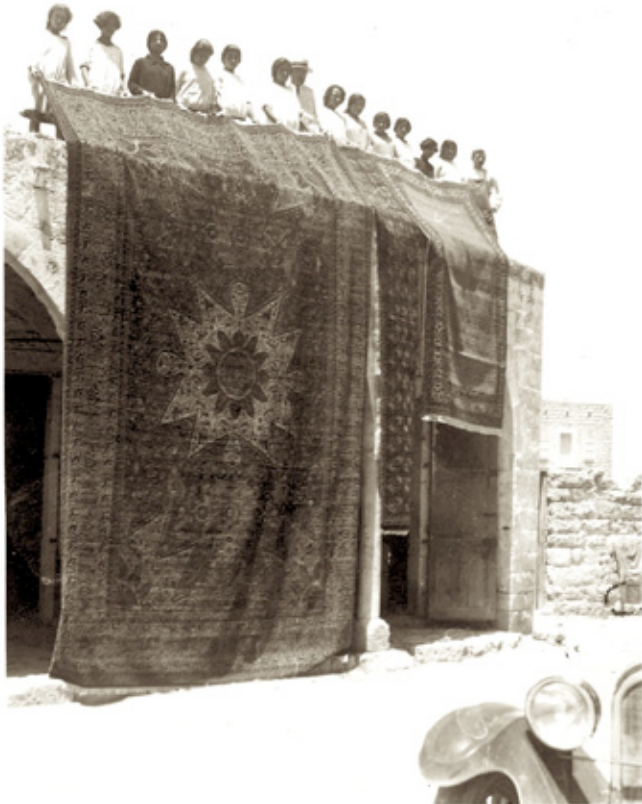
7. The large Coolidge Orphan Rug (18' 5" x 11' 7"), shown with other rugs in Ghazir, Lebanon, ca. 1925

Susan also illustrated orphan-related rugs created for reasons other than commerce. The Coolidge Orphan Rug, woven by orphaned girls in Ghazir, Lebanon, was donated to President Calvin Coolidge in 1925 in gratitude for NER's efforts to establish, fund, and support such orphanages (7, 8).