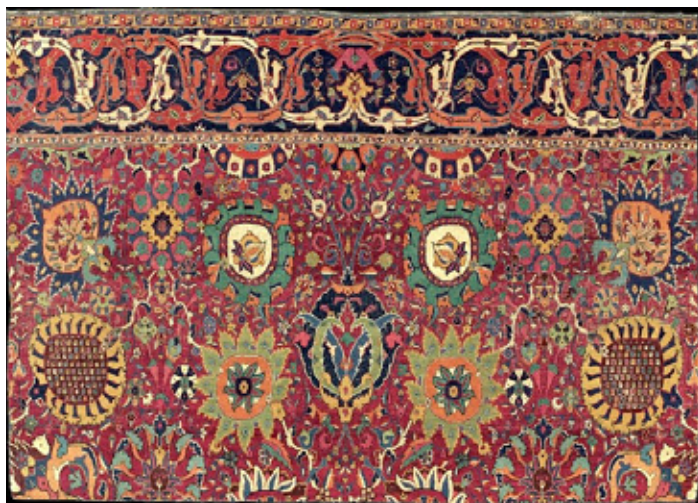
1. Lot 100, 6' 9" x 9' 5" fragment of an enormous "vase" carpet, estimated £250,000–350,000, sold for £542,500