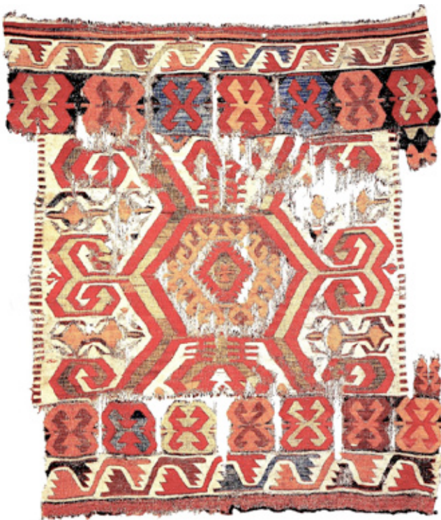
2. Small Anatolian kilim with the “turtle” motif