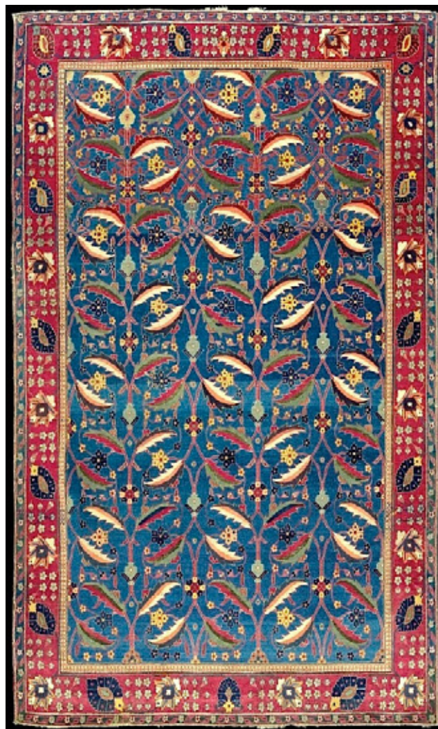
2. Lot 101, intact "vase" rug, 8' 3" x 5', estimated £1,000,000–1,500,000, sold for £962,500