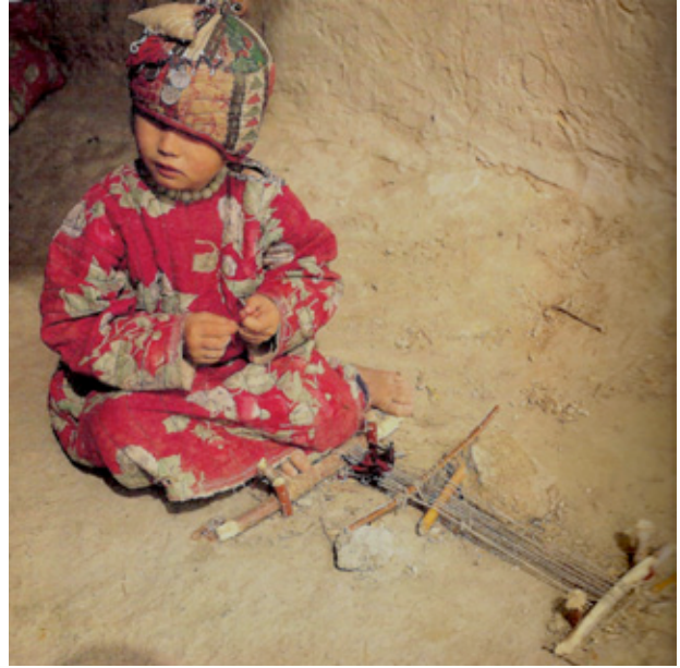
2. Turkmen girl learning to knot on her toy loom