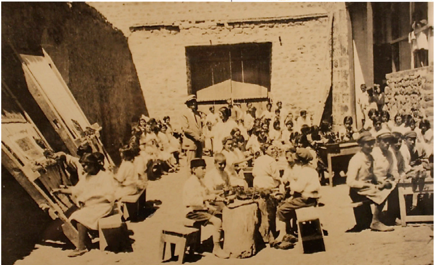
4. Photo of NER orphanage in Aintab (Gaziantep), showing girls weaving rugs and sewing, and boys working leather