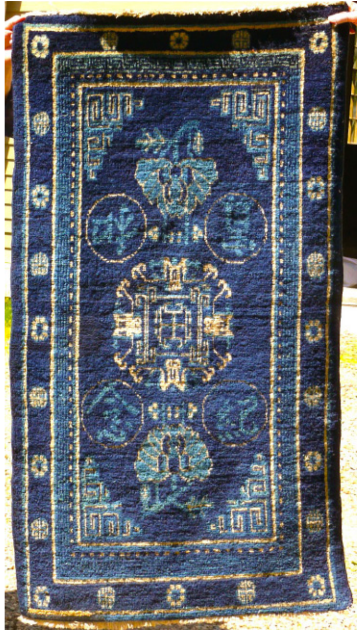
2. “Big Horse” rug, Yarkand (?), 1929–33 (?)