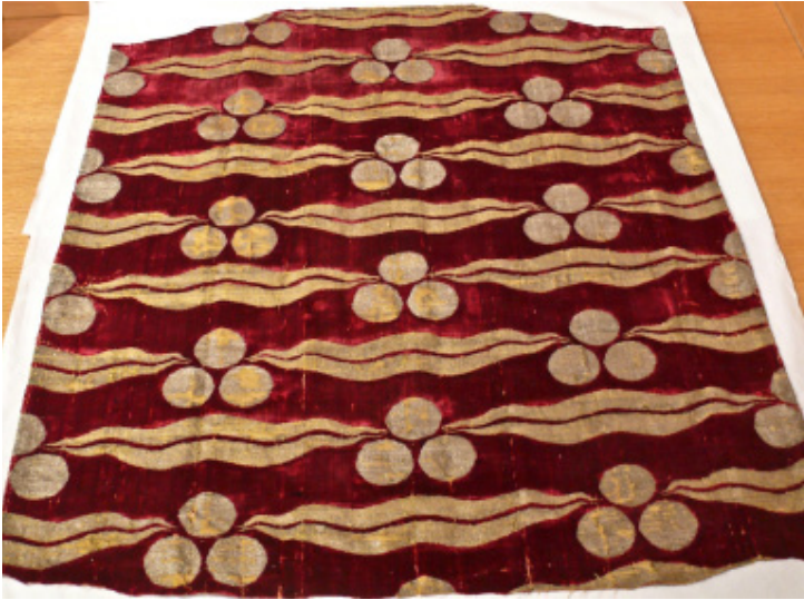
10. MFA Ottoman velvet fragment with çintamani motifs