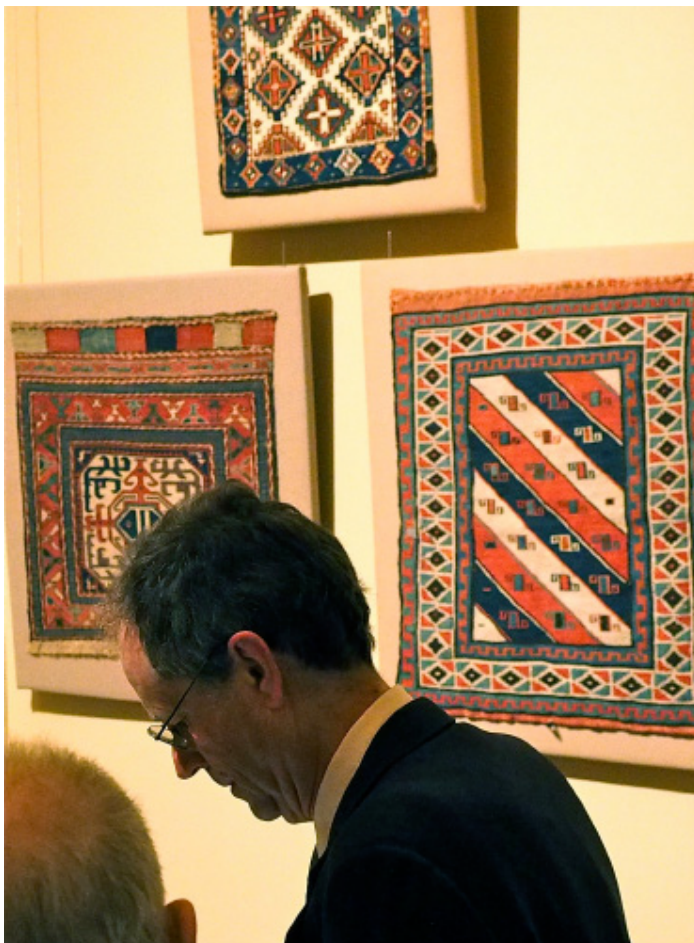
3. Three soumak bagfaces