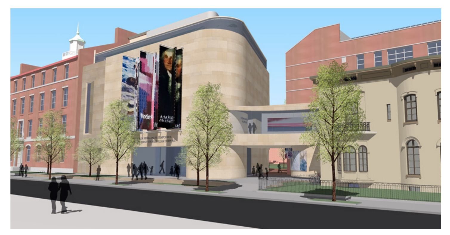
2. The future Textile Museum building at George Washington University, 21st and G Streets, Washington

Transfer of the TM's 19,000-plus textiles from S Street to Ashburn will begin in June and will take four months to complete. An inventory of all of the textiles in the TM collection determined that approximately 8,500—many of them fragments in drawer storage—required intervention before moving. The survey itself yielded a few interesting finds, including a mummified finger in one of the textiles.