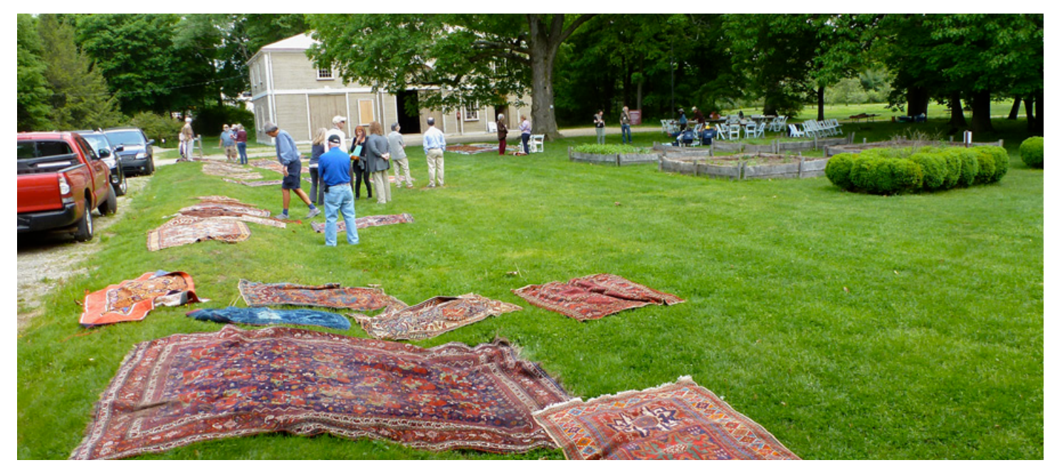
Members shop the moth mart at the 2013 picnic.