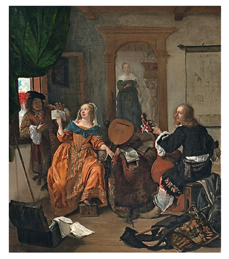
Gabriel Metsu's 1659 A Musical Party (MMA 91.26.11) includes a "chessboard" carpet draped over the table. It's in "Carpets from the East in Paintings from the West."

Boston, MFA "Carpets from the Gerard Paquin Collection" through August "Quilts and Color: The Pilgrim/Roy Collection" April 6–July 27 Cleveland, Museum of Art "Luxury Silks from Islamic Lands 1250–1900" through April 27 New York, Metropolitan Museum "Carpets of the East in Paintings from the West" through June 29 (see painting opposite) Vienna, Museum für angewandte Kunst (MAK) Opening of the reinstalled carpet gallery April 8