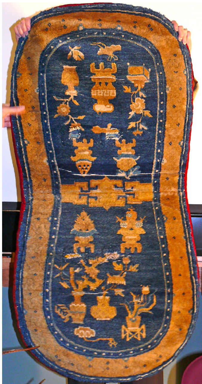
3. Inner Mongolian under-saddle rug