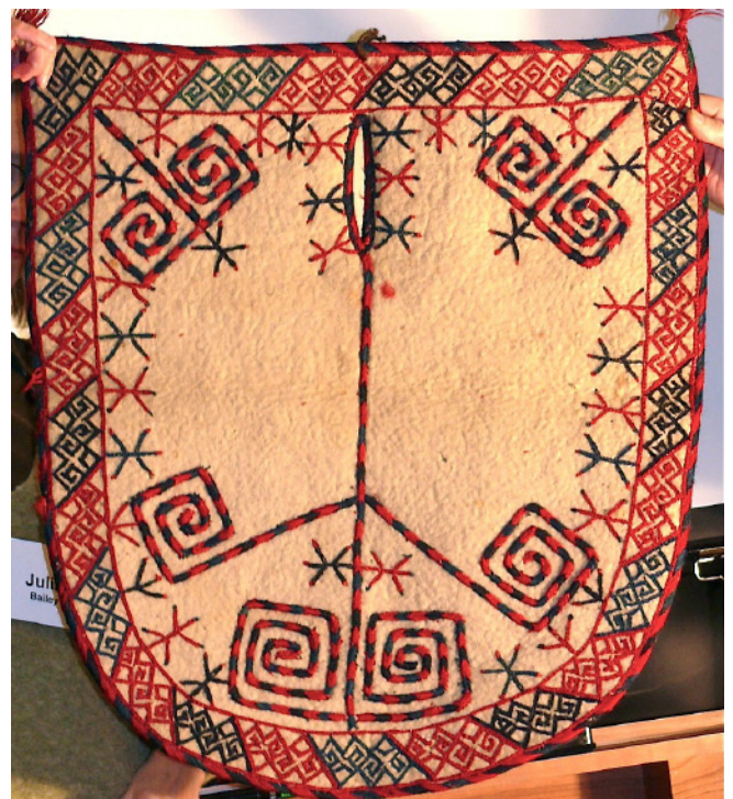
7 (top). Tibetan under-saddle rug