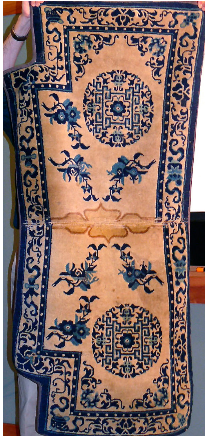
4. Ningxia under-saddle rug