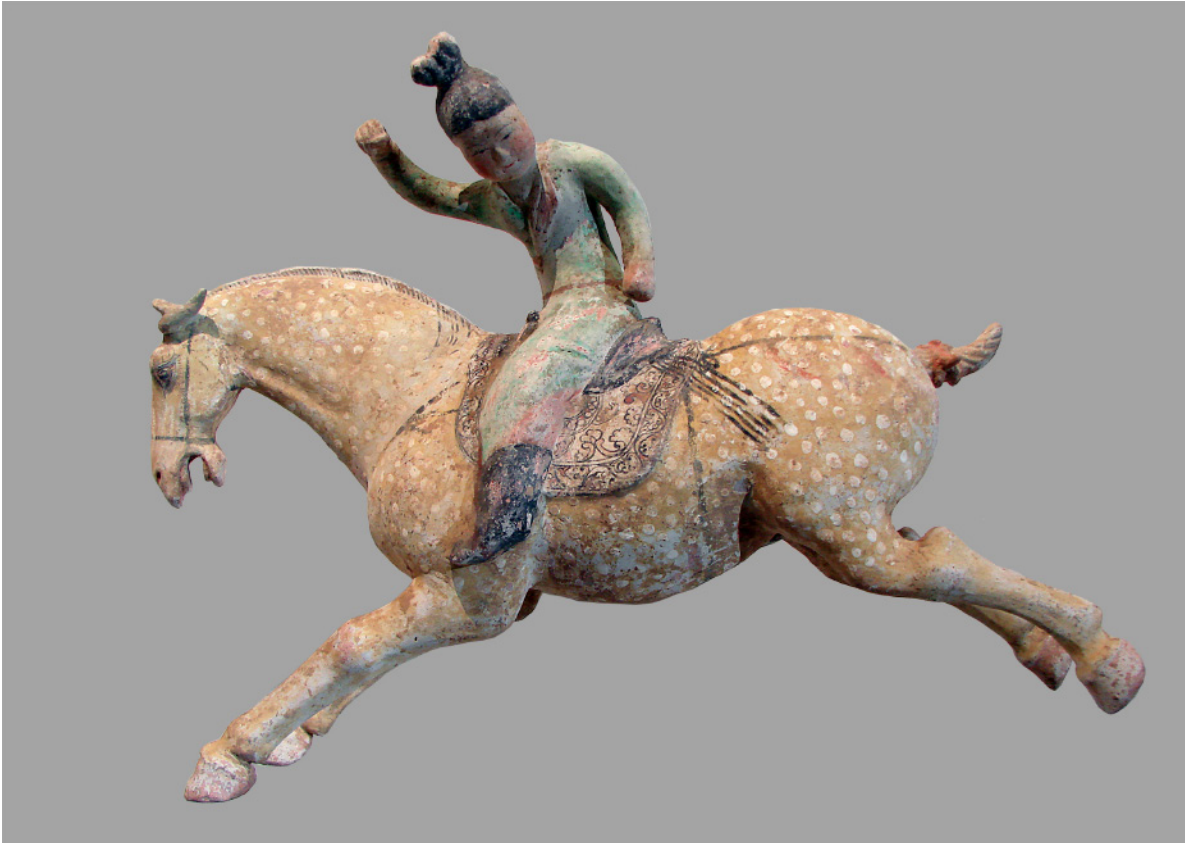
2. Tang ceramic figure of a female polo player, first half 8th century, Musée Guimet, Paris