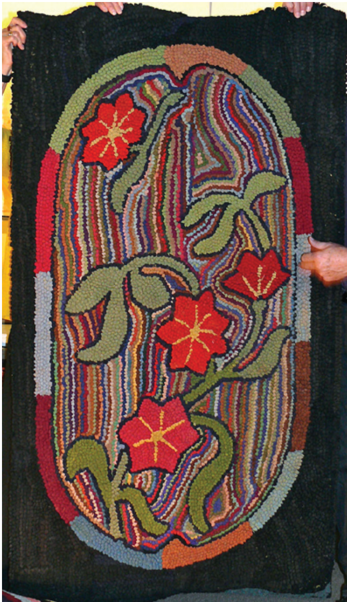
2. Victorian-style flora on a “hybrid Deco” rug

Lawrence then moved to “hybrid Deco” rugs, with elements from a number of traditional, typically nineteenth-century designs. He showed rugs that drew their influences from Victorian-era flower-and-vine motifs (2), and other examples with far-flung textile sources including Turkmen carpets, Navajo Two Grey Hills rugs, and possibly even Anatolian elibeline kilims (3).