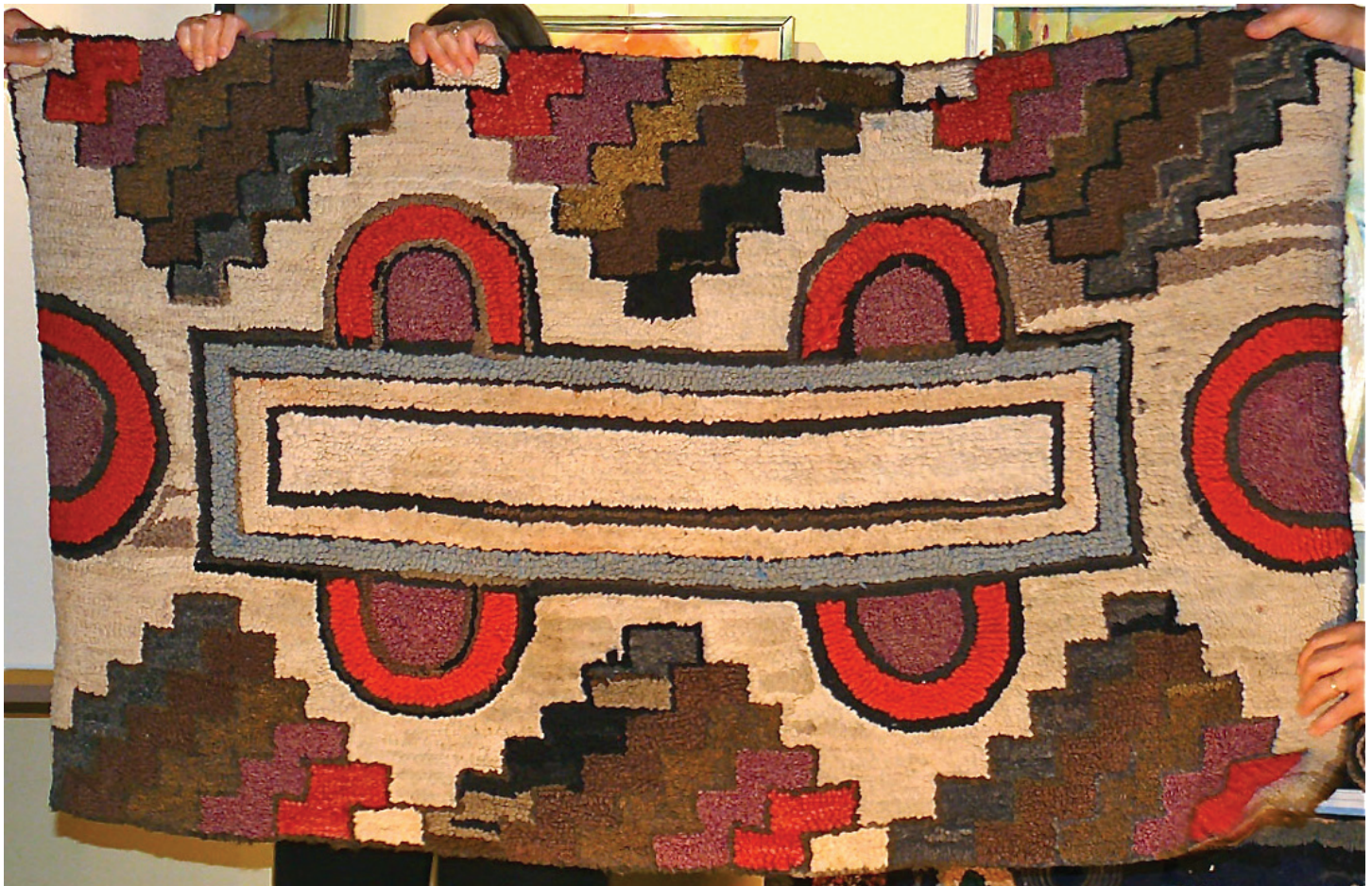
1. “Pure Deco” hooked rug

Hooked rugs fit the desire for modern style and mass consumption. They used inexpensive, widely available materials: recycled burlap grain sacks for the foundation, and remnants of old clothing for the pile. A few companies manufactured such rugs, but most were made by individuals—generally women aged 10 to 60—weaving for their own families. Hooking rugs required only simple equipment and relatively little practice (in comparison with knotting oriental rugs). Nevertheless, in Lawrence’s view, some of the women who made these rugs brought exceptional artistic talent and skilled execution to their