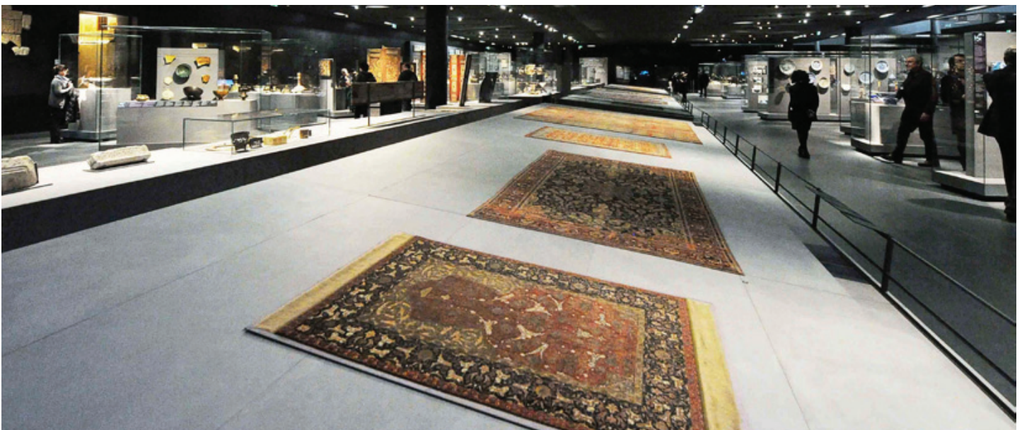
2. One level of the new Islamic art wing, Louvre, Paris

The Anhalt Carpet (3) is another rug redeemed by analysis. It was acquired by the Met in 1946 as sixteenth-century Persian, but in 1973 was judged a fake by three luminaries of rug scholarship: Friedrich Spuhler, May Beattie, and Charles Grant Ellis. Their reasons were different: Ellis claimed the rug had the wrong yellow color; Beattie considered its condition too good; and Spuhler cited design imperfections that, in his view, wouldn’t have been