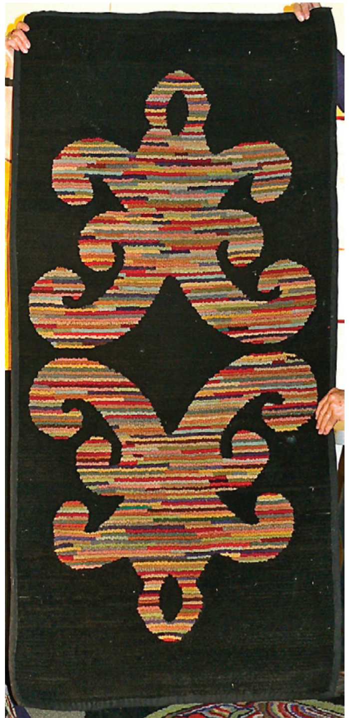
3. An elibeline -inspired “hybrid Deco” rug?