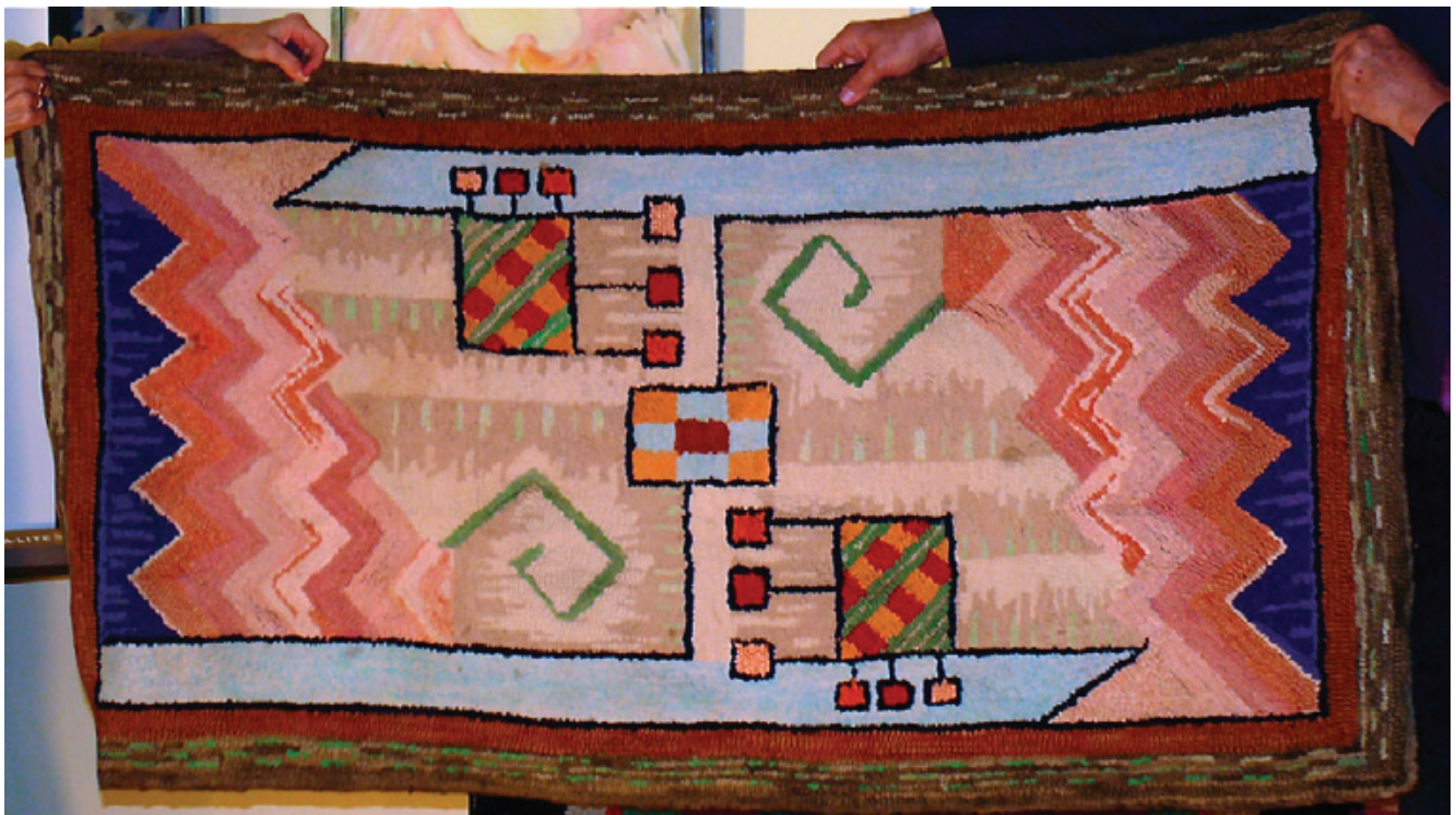
4. Two of Lawrence's "Modernist" hooked rugs, exhibiting spare (above) and exuberant (below) design schemes