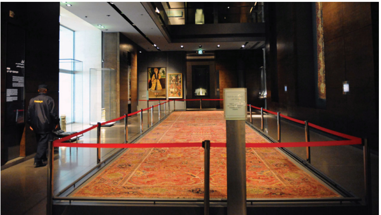
1. A gallery of the Museum of Islamic Art, Doha, Qatar

Following this “tour,” Walter understandably spent the most time talking about the new galleries at the Met, which expanded the space available for the display of Islamic art by 35 to 40 percent, most of which has been used for carpets and textiles. Even with increased space, there remain many constraints on carpet and textile presentation, including factors of wall height, lighting, platforms, and hanging systems. The Met has set conservation requirements for carpets and textiles: silks can be displayed for only three months and pile carpets for twelve to twenty-four. Following exposure, carpets and textiles are stored for five to six years. Walter noted that the Doha museum doesn’t practice such