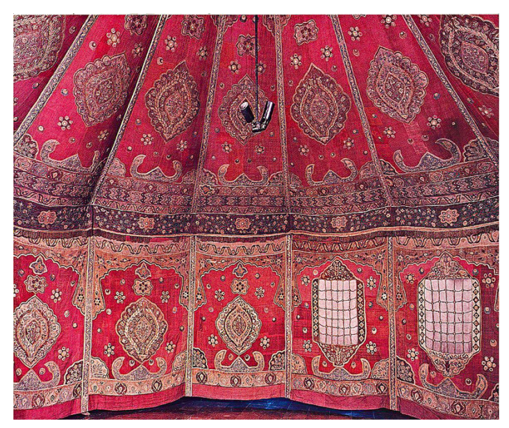
Ottoman tent interior.

She invites NERS members to bring examples of Ottoman-era costumes and textiles (not necessarily tents!) for a show-and-tell following her presentation.