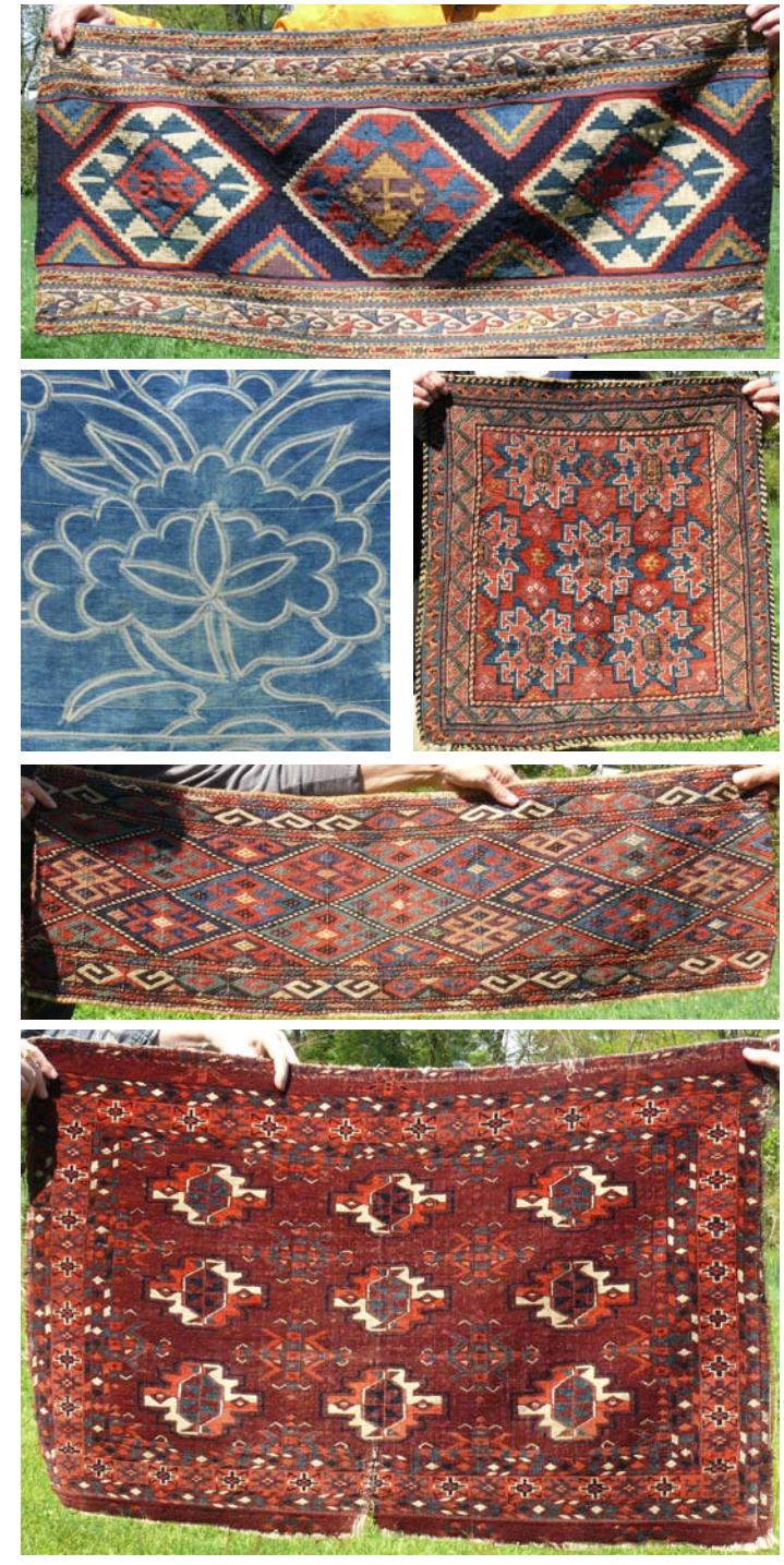
Left, from top: silk appliqué Kazakh collar, Kirman pile carpet fragment, Central Anatolian (Mut?) kilim, Fachralo Kazak pile prayer rug.

Right, from top: Shahsavan kilim-and-soumak mafrash side panel, Miao sewn-resist valance (detail), Khamsa (?) soumak khorjin face, Hashtrud or Khamsa (?) mafrash side panel, Yomud pile chuval.