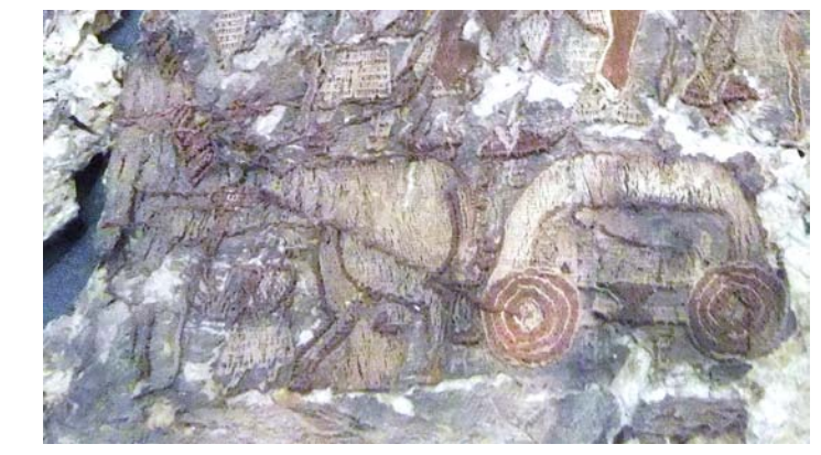
3. Detail of fragment showing horse and carriage.