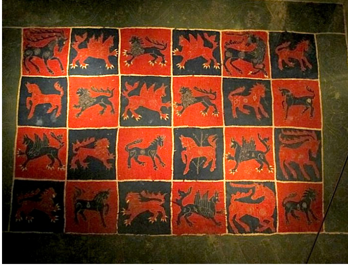
11. Swedish felt appliqué in the Historiska Museet.