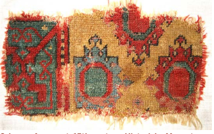
6. Lamm fragment, 15th century, Historiska Museet.

Perhaps the most exciting aspect of Stockholm and the St. Petersburg extension was the chance to spend some time with the iconic rugs that one had only dreamed of ever seeing. In Stockholm it was the Marby rug (5), the Safavid hunting carpet (4), and the Lamm Fostat fragments (6). In St. Petersburg it was the Pazyryk felts (9), not to mention the rug (10) from the same tomb! Throw in our success in convincing the curators in the Russian Museum of Ethnography to unroll some of their many Kyrgyz reed screens ( 7 ), and you had the makings of a real week of rug adventures.