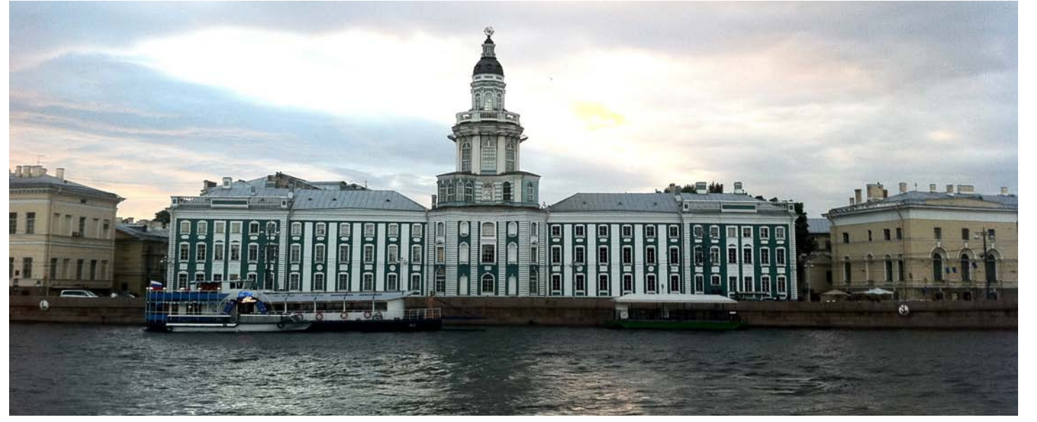
13. White night on the Neva, from the boat.