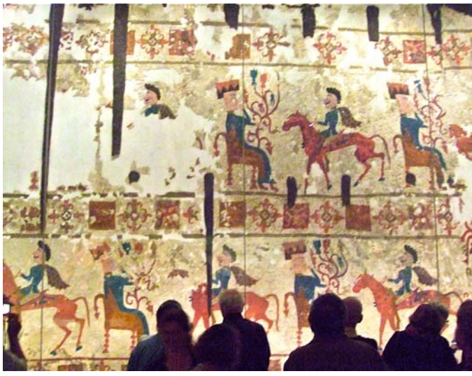
9. Monumental Pazyryk felt in the Hermitage.