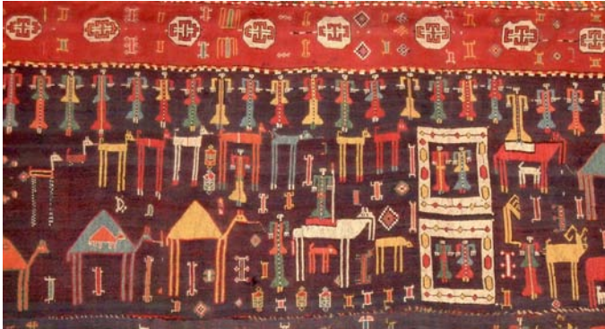
8. Shadda (detail) at the Museum of Ethnography.

Day 2. We brave the Hermitage. First we must listen to Russian museum types attempting to read papers