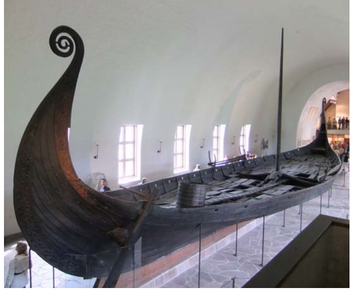
1. Oseburg burial ship, Viking Ship Museum, Oslo.

For more information, see www.absolutetapestry.com/en/history/oseberg