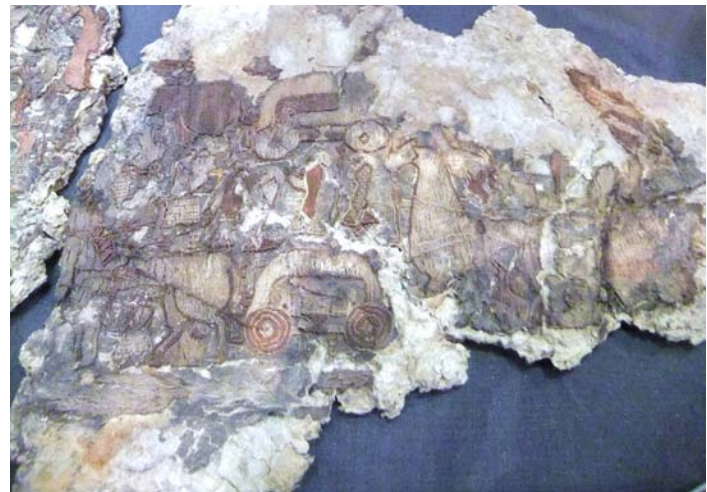
2. Oseburg tapestry fragment.