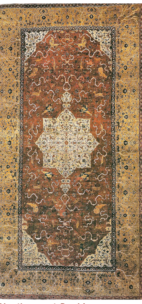
4. Safavid hunting carpet, Royal Armory.