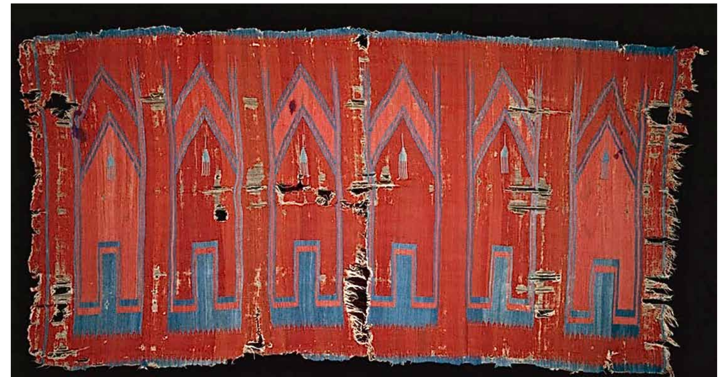
Left and above: Anatolian kilims on display in the current exhibition at the de Young. Above right: cover of the 1990 catalogue of the collection.