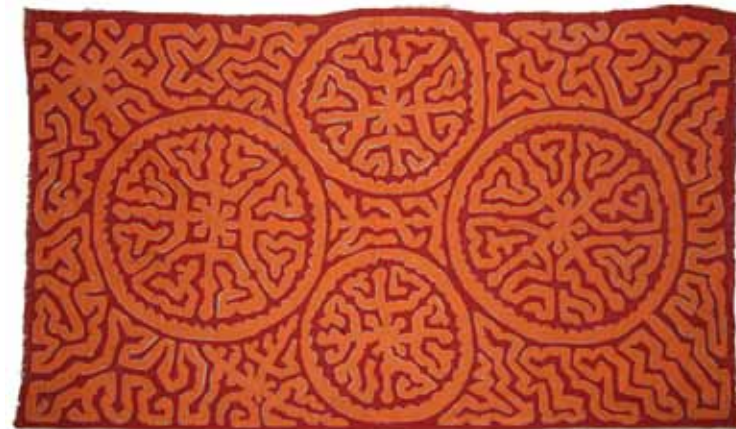
2. 1930s abstract mola.

A mola is basically a shirt or blouse worn by Kuna women. These garments have decorative panels, but also