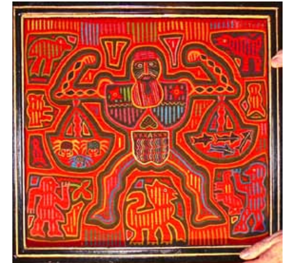
4. NERS member's "superhero" mola, 1960s.

Tom concluded his overview by enumerating his own design categories, grouping designs into eight "buckets." The first he labeled abstract floral: he showed some examples, the earliest of which was collected in 1922. The second category was of land animals, with squirrels and monkeys being particularly popular in the mola design vocabulary. Sea or water creatures—sea worms, frogs, and turtles, among others—made up the third category. Household objects were the fourth, with examples that included carved wooden plates, hammocks, coconut husking tongs, and incense braziers. The fifth category comprised figures from Kuna myth and ritual, such as spirits rising from animals, the spirit resting-place, healers, and Kuna birth-myth characters. Tom's sixth category was politics: Kuna artists were particularly fond of political