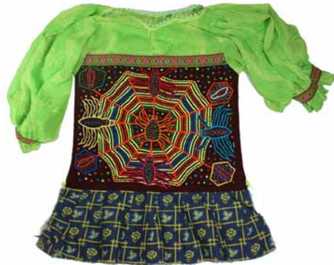
1. Intact Kuna blouse with spiderweb mola, 2010.