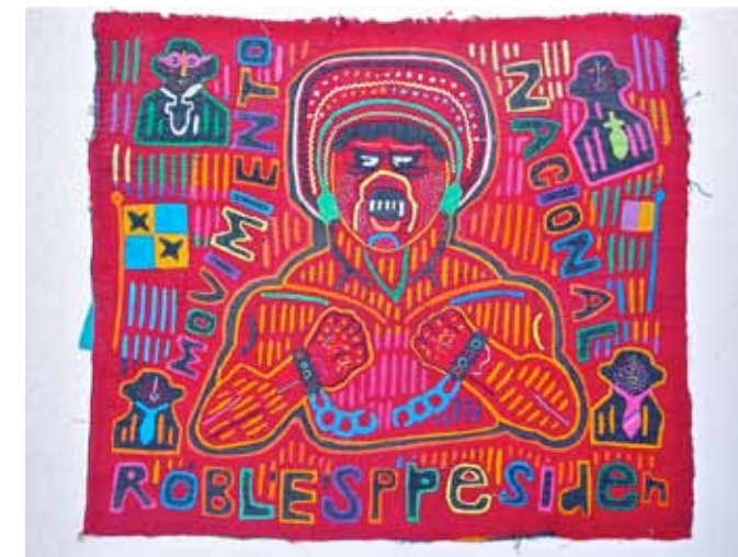
3. Political mola, 1963.