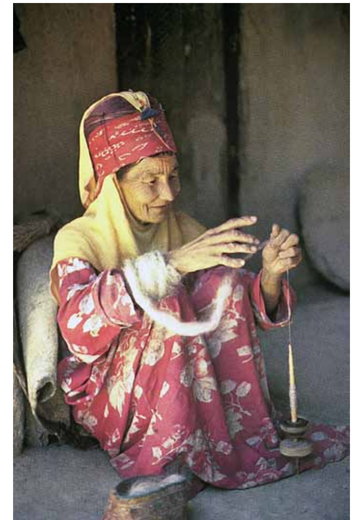
A Turkmen woman spinning.

Turn right on Church Street and enter the municipal lot on the right. Most meters are free after 6 p.m., but check to make sure!